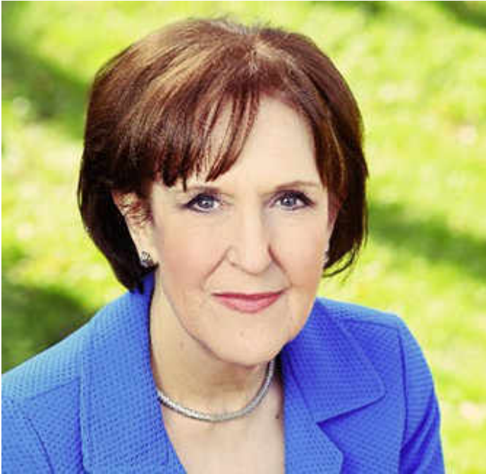
Karen Tumulty

Presently we are witnessing a new administration working to shift the nation from right to left, from starboard to port in marine terms. But will the ship heave, or will the hull crack? President Biden has proclaimed and often repeated that he is hoping and calling for a time for unity, not just to fight an out-of-control virus but also to address racial differences and tense sociological disarray.