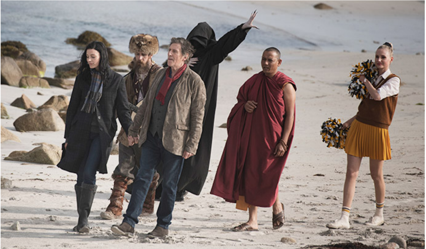
Scene from Death of a Ladies' Man

Gabriel Byrne stars as a literature professor in Montreal who has hallucinations due to an inoperable brain tumour. One recurrent imagining is his deceased father, Brian Gleeson , who gives advice from the beyond. Jessica Pare plays the most prominent of his various liaisons.