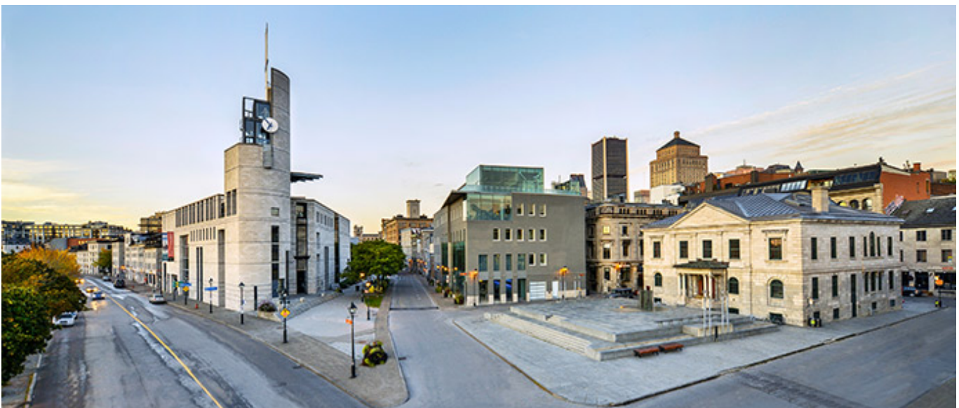
Pointe-à-Callière, Montréal Archaeology and History Complex

On May 17, 2022, as Montréal celebrates turning 380 years young, Pointe-à-Callière will also mark its 30th anniversary. In honour of this double birthday, the Montréal Archaeology and History Complex is welcoming the public free of charge all day long and will have a few surprises in store both on-site and online.