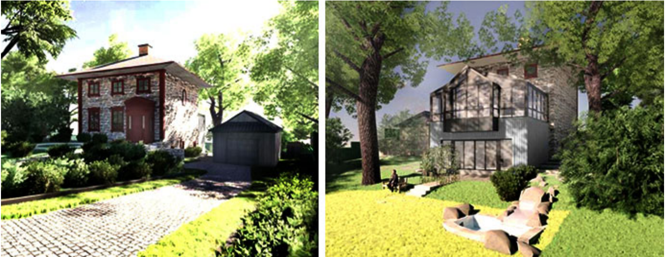
Goode house proposed renovations, front and back

However, when I clicked through to the plans, I discovered the project entails adding a large “new two-story volume” to the back of the house. A doorway and two windows are to be substantially enlarged, which entail cutting away the exterior stonework. A new basement entrance is to be cut into the side as well.