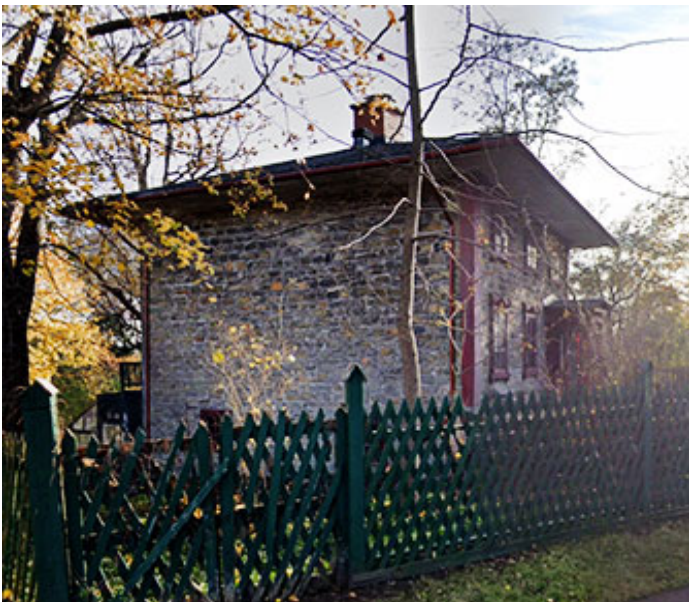
Existing East side of the Goode house as seen from Cote St. Antoine Road

The Westmount Independent ran an upbeat article in November 2020 on recognizing the Goode house as a “local heritage landmark” (p. 10)