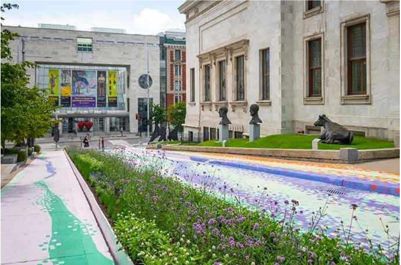
The MMFA Sculpture Garden. Sailboats, 2020, installation by Collectif Escargo

Sign-up to our newsletter and get email notification of our most recent articles