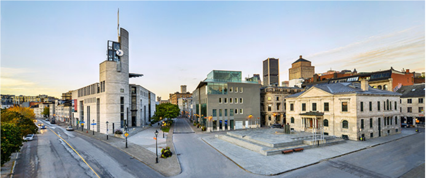
Pointe-à-Callière, Montréal Archaeology and History Complex