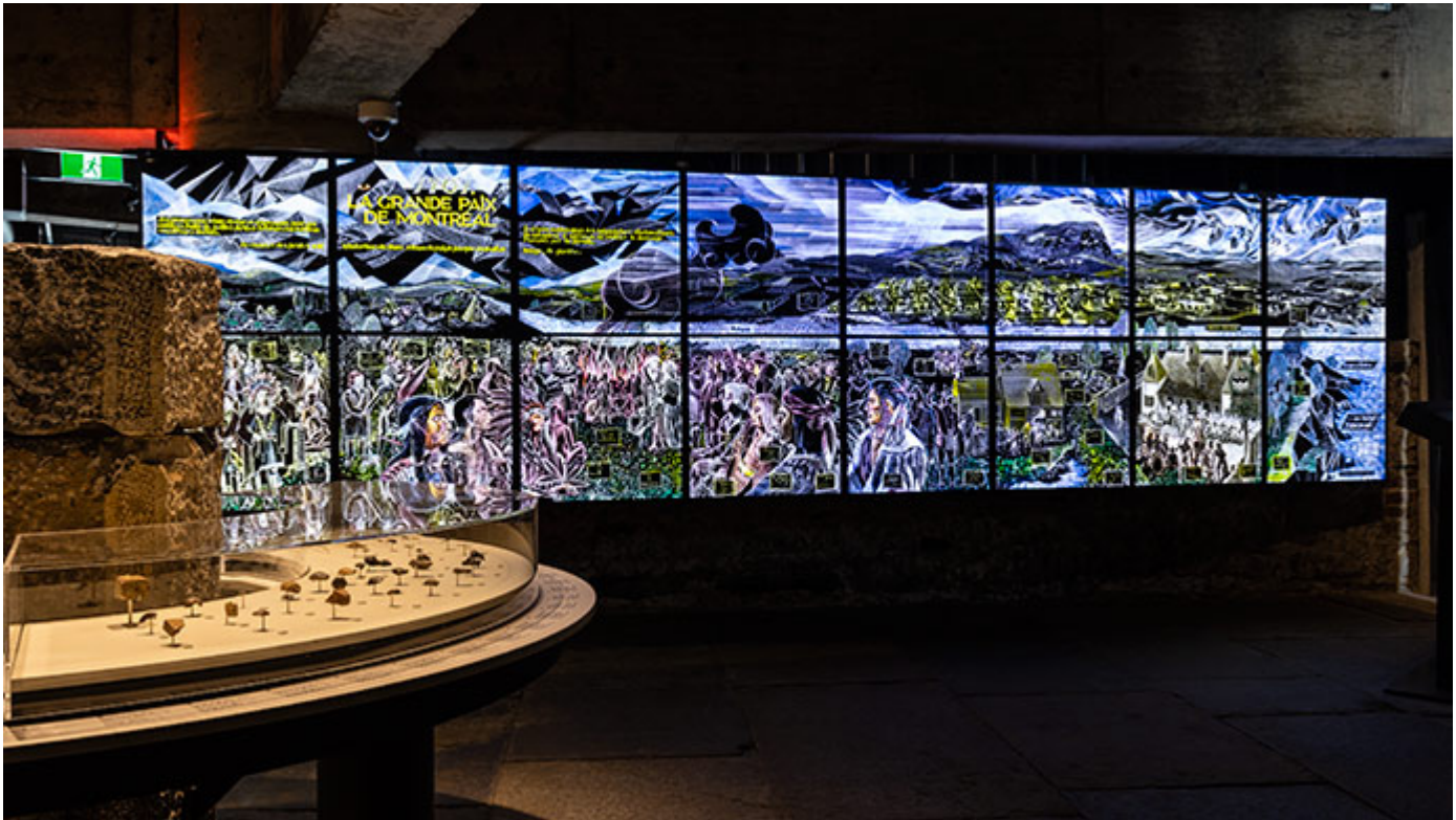
Pointe-à-Callière, Montréal Archaeology and History Complex

international exhibition VIKINGS – Dragons of the Northern Seas, which has an interactive component that lets visitors discover Montréal's Scandinavian communities.