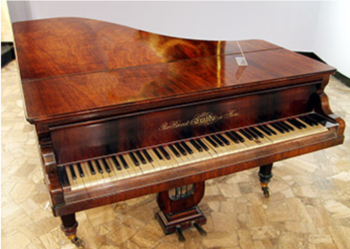
Erard Piano

This concert will also be an opportunity to hear the magnificent Érard piano, centerpiece of Bourgie Hall's instrument collection. Built in London in 1859, this piano possesses an exceptional tone, ideally suited to the subtleties and nuances of the Romantic repertoire and thus enabling the performer to recreate with accuracy the pianistic style of the time.