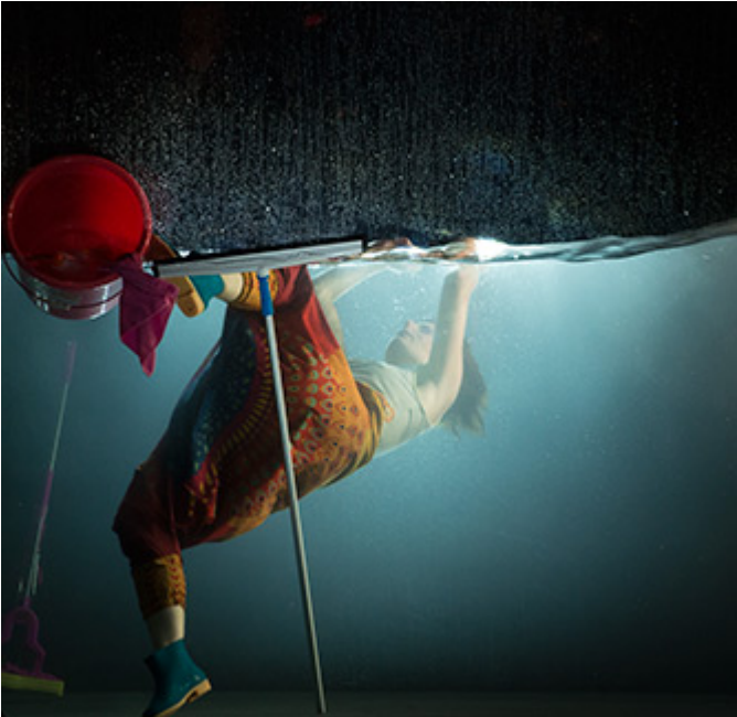
Holoscenes