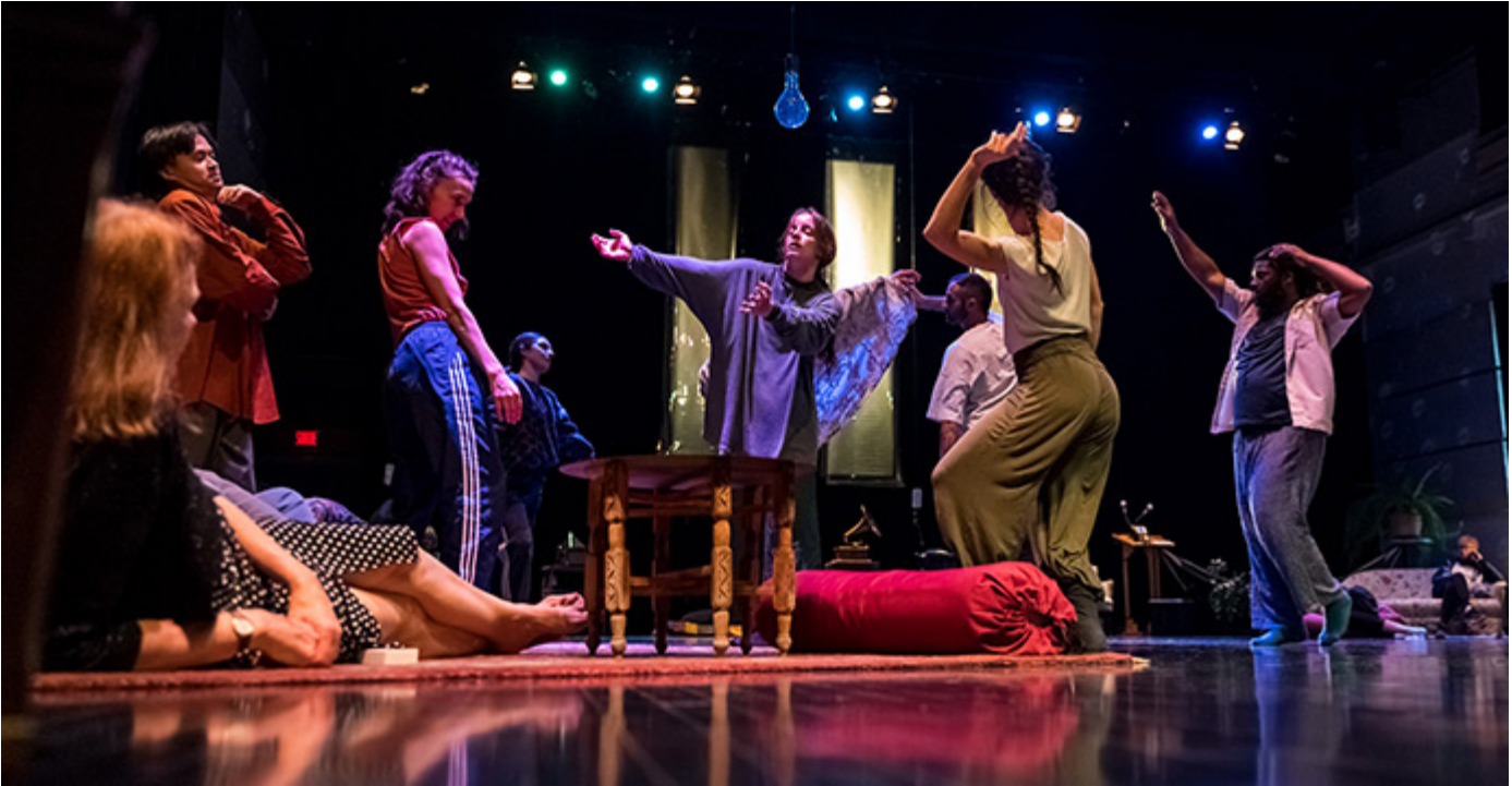
Invisible