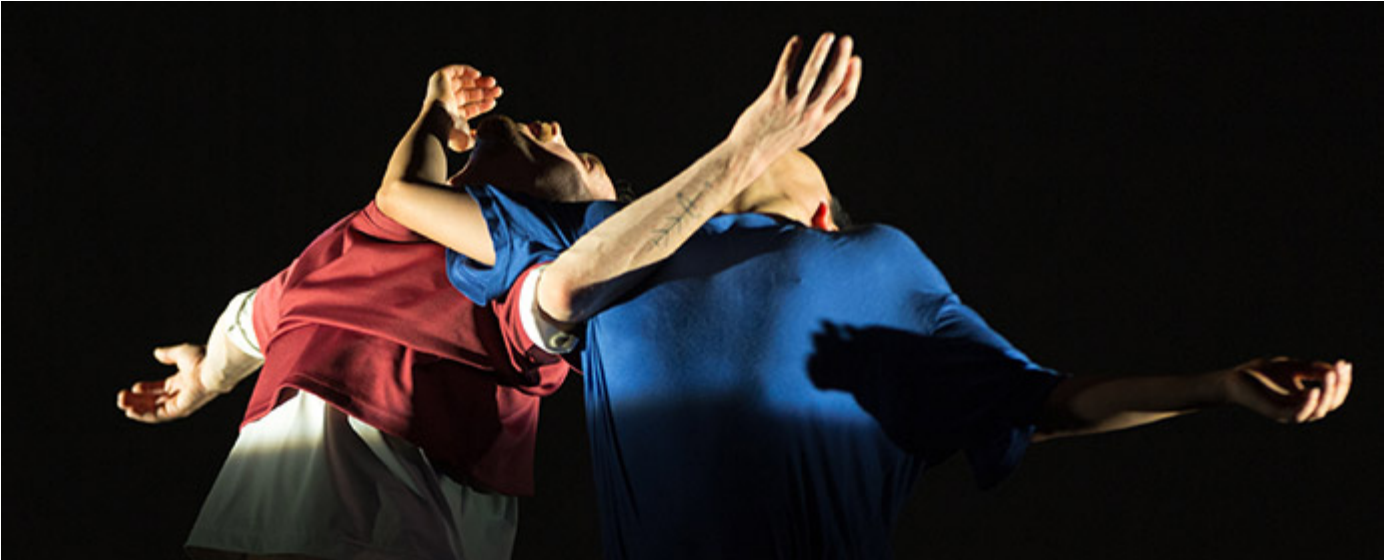
Face to Face – Image: Jeremy Mimmagh