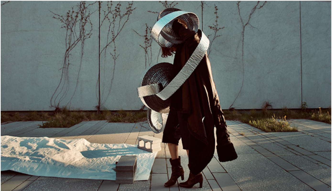
Them Voices – Image: Charles Lafrance

Make Banana Cry ran until June 5 at the Salle polyvalente de l'UQAM