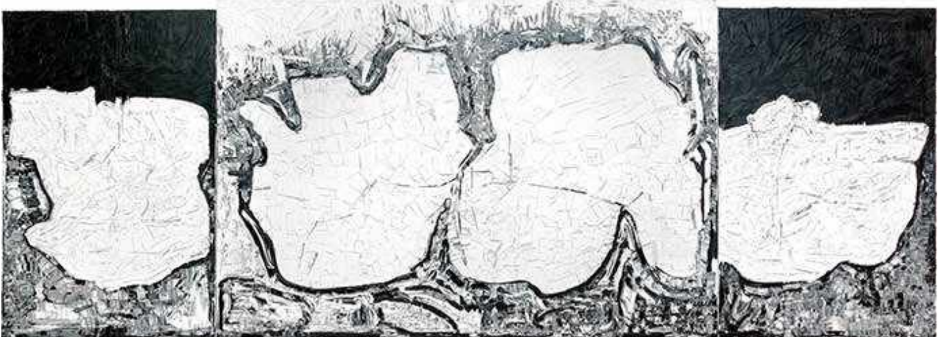
Jean Paul Riopelle, Pangnirtung, 1977

As we wait for Quebec museums to reopen, the Montreal Museum of Fine Arts (MMFA) is offering the public free access to the virtual edition of its new exhibition, Riopelle: The Call of Northern Landscapes and Indigenous Cultures , from December 1, 2020, to January 11, 2021 .