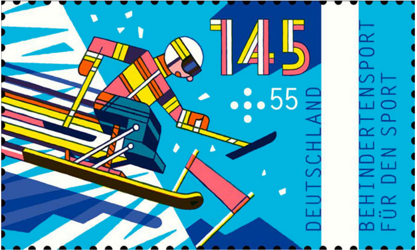
Behindertensport Für den Sport, 90, 2015 – Stamps from the annual series on sports

creations in different formats produced through a variety of printing techniques. They invite visitors in to discover the work of Wagenbreth, a juggler of ideas and illustrations, whose graphic style evokes Art Brut.