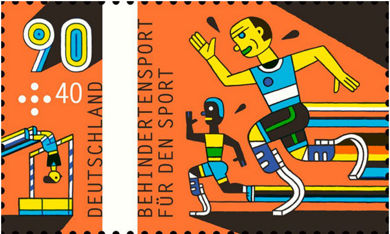
Behindertensport Für den Sport, 90, 2015 – Stamps from the annual series on sports