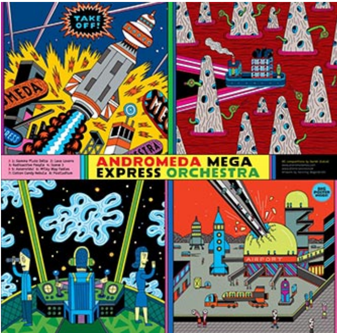
Andromeda Mega Express Orchestra Take off!, Alien Transistor, 2009