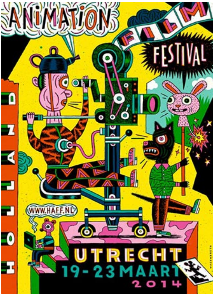
Holland Animation Film Festival, 2014 – Serigraphy