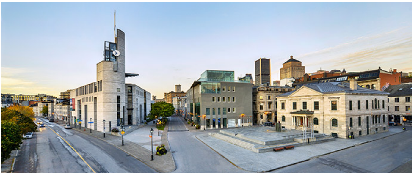
Pointe-à-Callière, Montréal Archaeology and History Complex

On May 17, 2022, as Montréal celebrates turning 380 years young, Pointe-à-Callière will also mark its 30th anniversary. In honour of this double birthday, the Montréal Archaeology and History Complex is welcoming the public free of charge all day long and will have a few surprises in store both on-site and online.