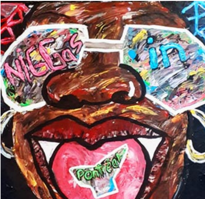
Niggas in Pontreal

Billed as an absurdist comedy inspired by Samuel Beckett's Waiting For Godot . Here, the two tramps are renamed Pick and Pod. How do you do an absurdist play modelled on another absurdist play? Perhaps it is more a parody? Ah, words, words. Let's check it out. (Venue 3, 60 minutes)