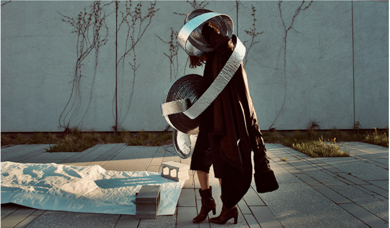
Them Voices – Image: Charles Lafrance

Make Banana Cry ran until June 5 at the Salle polyvalente de l'UQAM