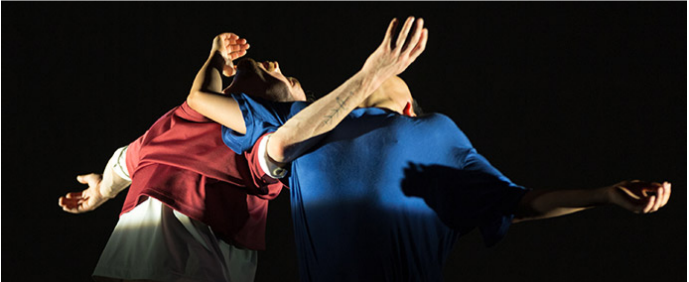
Face to Face