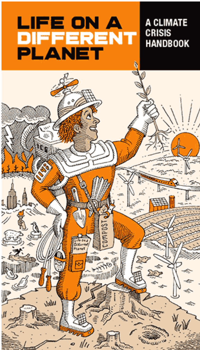
Life on a Different Planet book cover

WM: Do you illustrate your books, and what is the secret to matching text to images? To what extent is the dialogue and text designed to help children learn to recognize objects and colours, get to know the alphabet and teach themselves how to read?