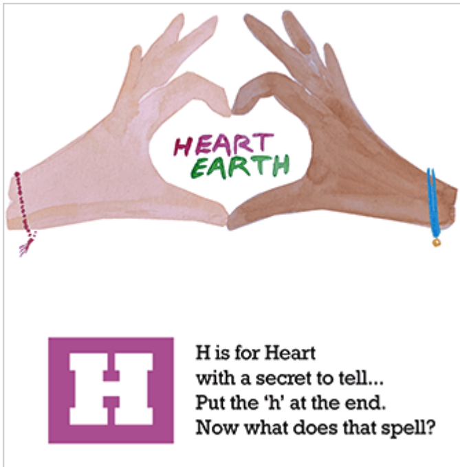
The letter H as depicted in AB(zero)C