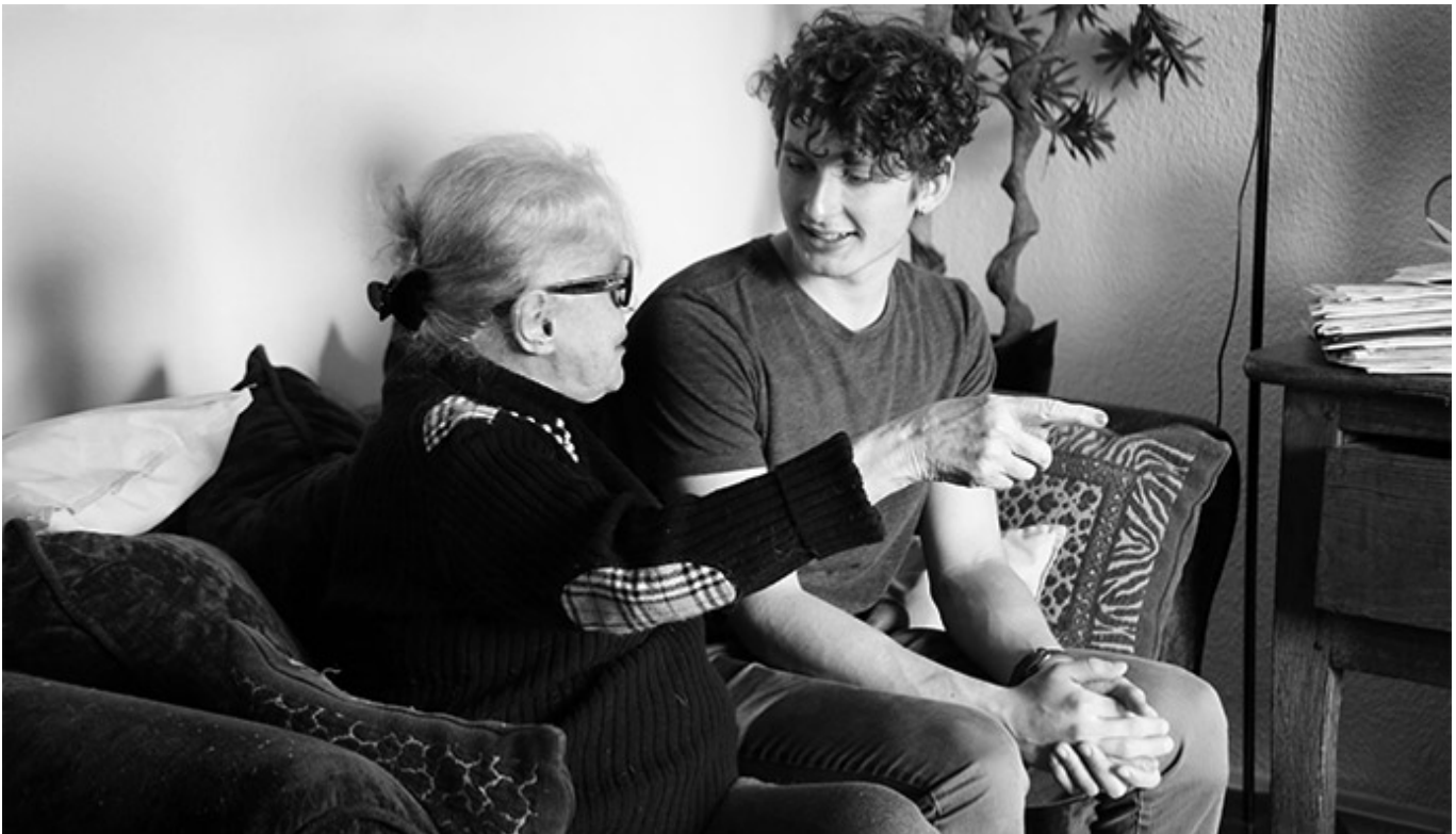
A volunteer visits with a senior