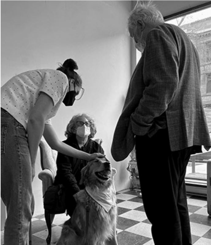
A volunteer provides pet therapy to seniors at home

As a matter of fact, The Yellow Door is a registered charity that operates intergenerational programs and activities that bring young adults and seniors together in the promotion of mental and physical health and the prevention of social isolation among all ages.