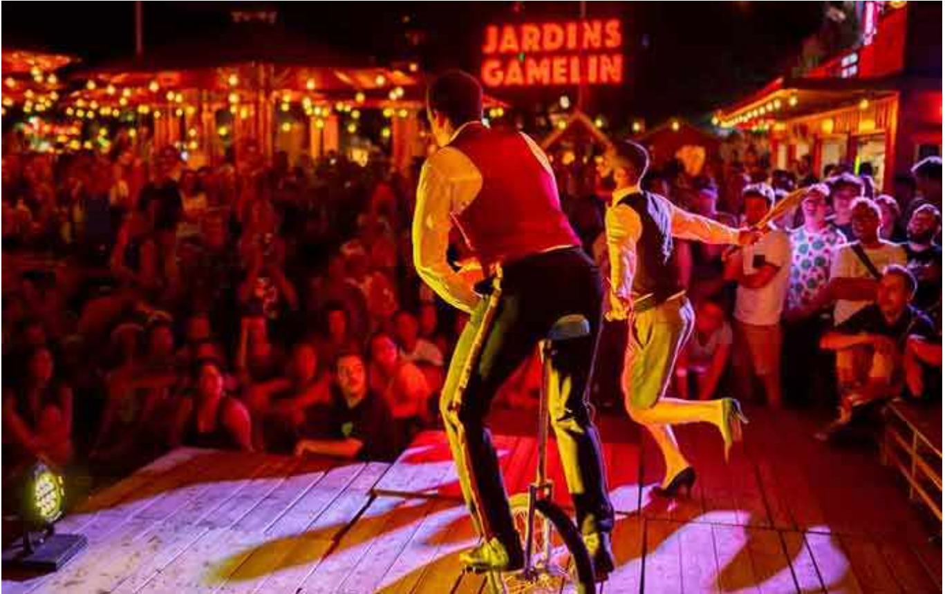
Jardins Gamelin

Each Sunday, trivia nights with Randolph brought together dozens of teams of all ages. The BANQ's discovery workshops, offering an encounter with the heritage of Place Émilie-Gamelin and nearby neighbourhoods, inspired many people to look back on bygone days. When the weather was nice, outdoor yoga and meditation sessions in the Inspirez, expirez series were more popular than ever.