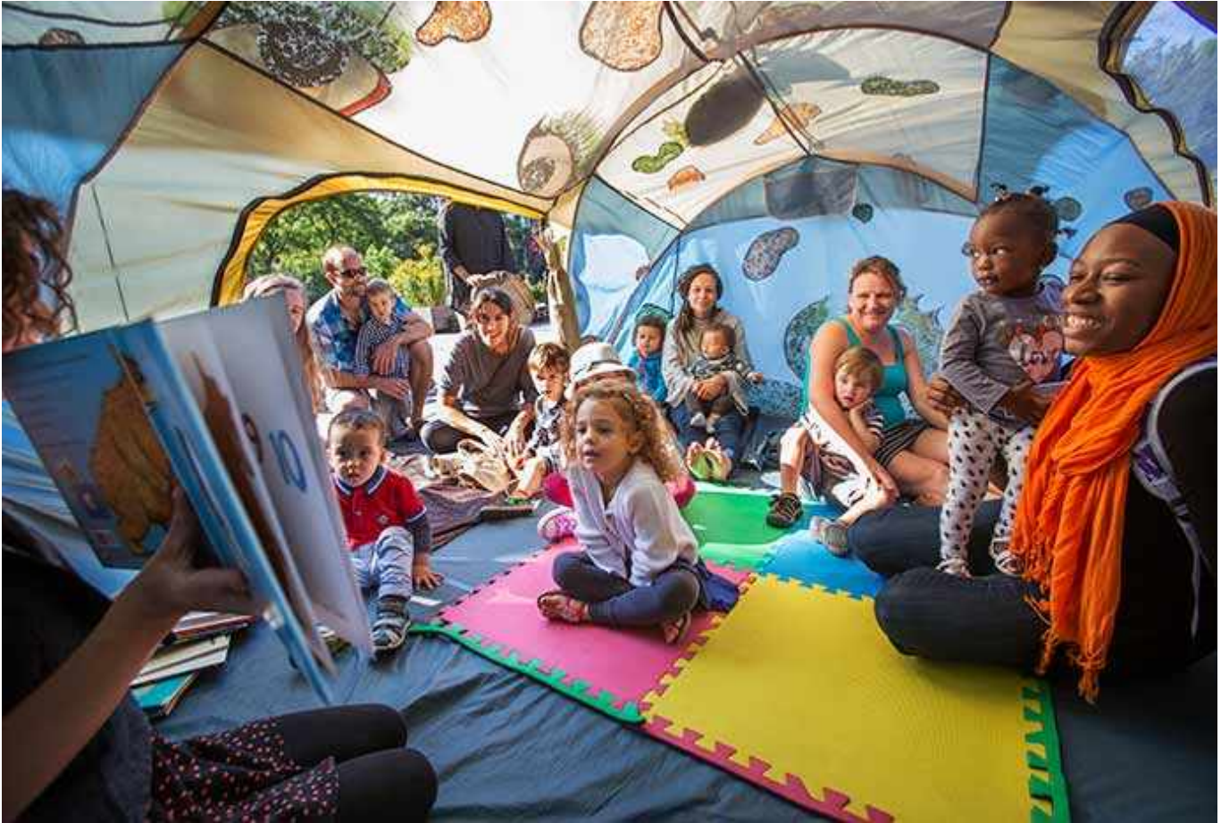
Les matinées familiales avec Petits bonheurs, Jardins Gamelin

Once again this year, Les Jardins Gamelin offered the public an extensive program of arts and culture, free of charge and 100% made in Montreal. Visitors had varied experiences, as inspiring and unifying as they were entertaining. Thanks to Sentier Urbain , visitors and passers-by gained plenty of new knowledge about urban agriculture and the environment, with more than 20 practical workshops and talks, and casual meetings with the gardeners in the greenhouse throughout the season.