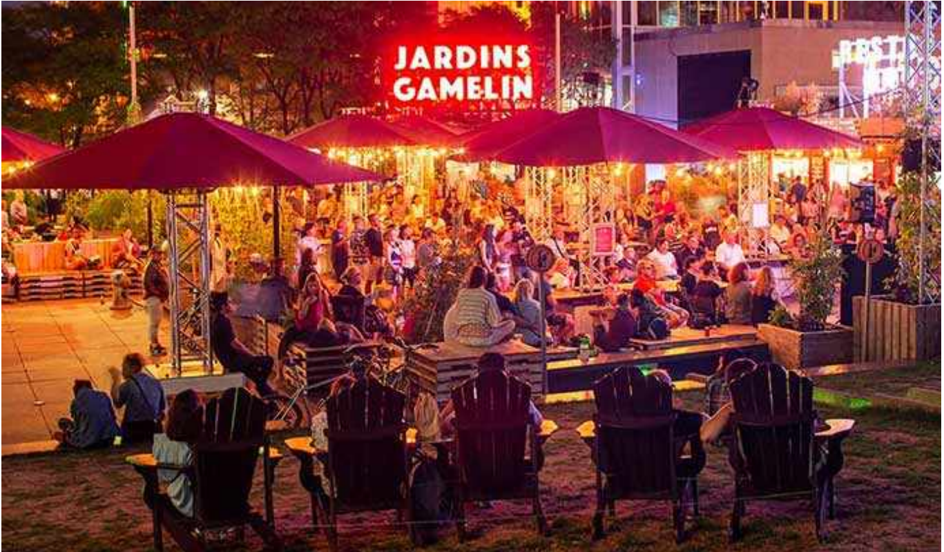
Jardins Gamelin – Ambiance soirée.jpg