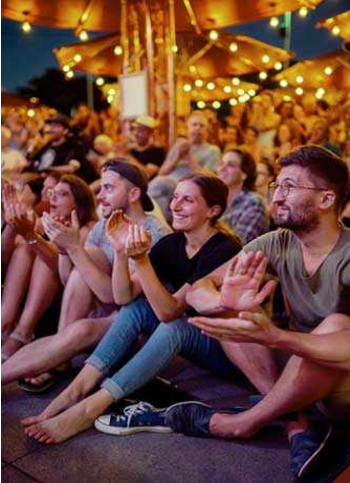
Jardins Gamelin

In August, the Cabaret series – four highly original and utterly unforgettable evenings – returned to the Jardins for a second season. And for the first time, the space was the venue for the large-scale multiplayer werewolves game Loups-Garous , a big success for everyone who participated.