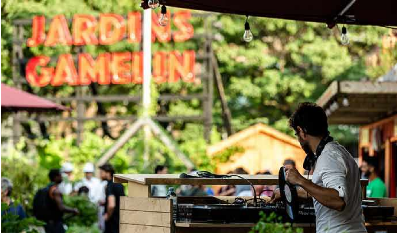
Jardins Gamelin

The Jardins' success is due largely to the exemplary spirit of collegiality and collaboration shown by a number of stakeholders, including the borough of Ville-Marie, the Montreal police service, Sentier Urbain, the Société de développement social and Jardins staff. All have contributed to social outreach and intervention at the site by sharing their expertise while tackling the challenges involved in animating the space.