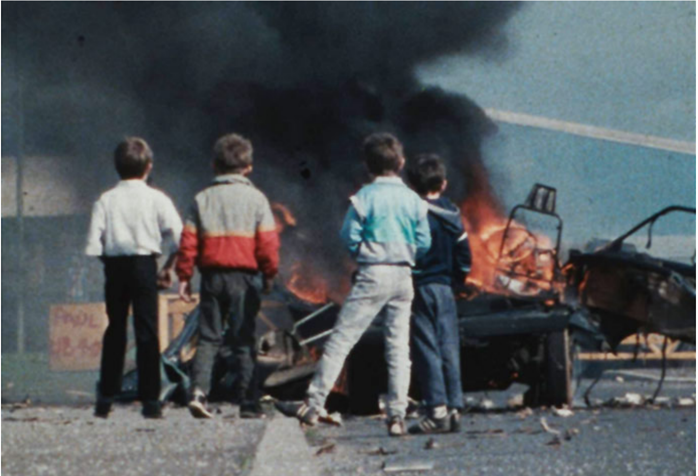
Scene from the film The Image You Missed