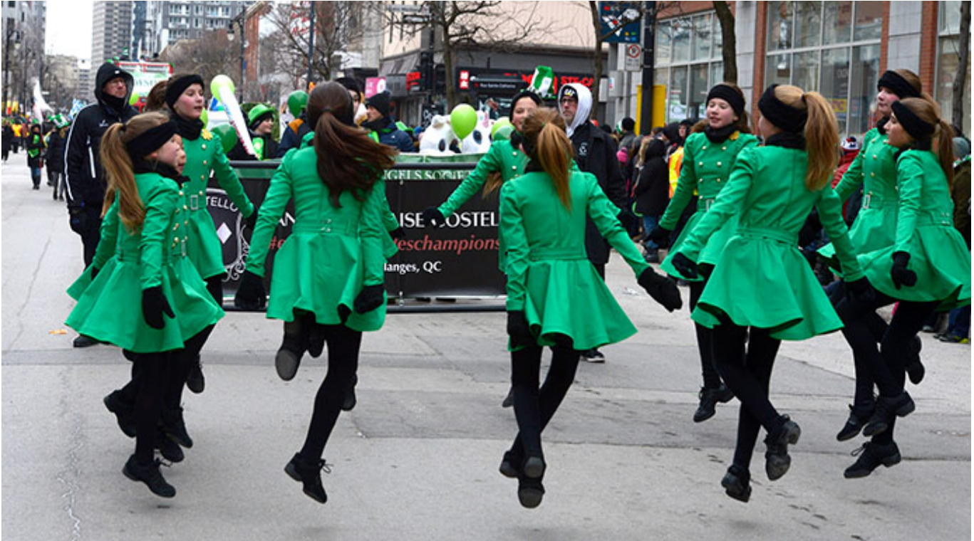
Irish dancers at St. Patrick parade