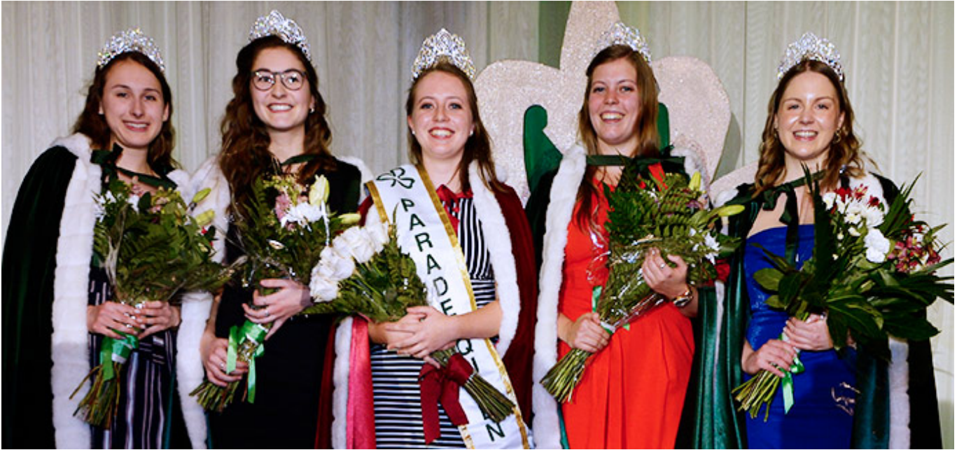
The Saint Patrick's Day parade queen and her princesses

The day before, Montreal exurb Hudson also had its parade, first established in 2009, down Main Street.