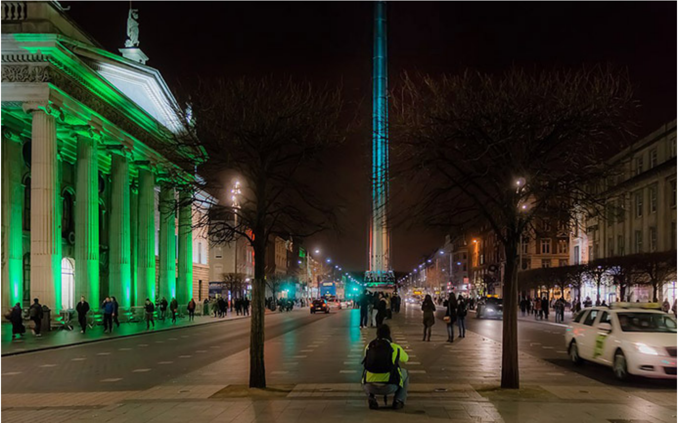
Saint Patrick's Day in Dublin