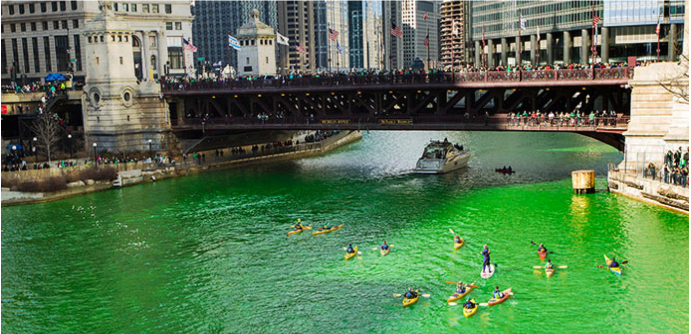
Saint Patrick's Day in Chicago