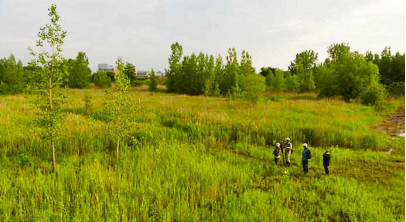
Among the auction items offered are guided nature walks