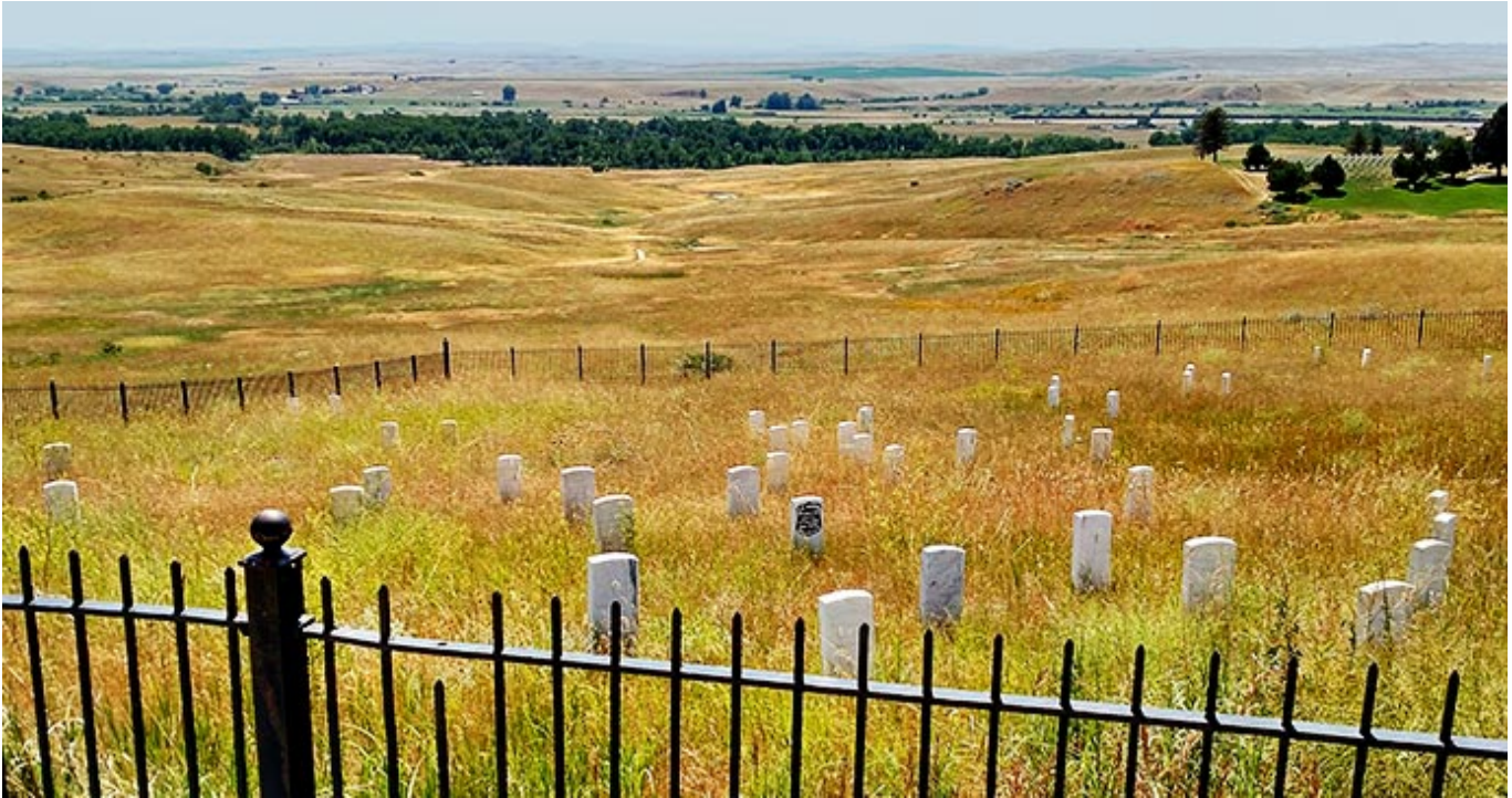
Little Big Horn – Custer’s tomb is in centre

Fast forward 146 years to 2022, the Russian military in tanks, backed up by airplanes and long-range missiles, and inspired by Russian mythology that it was meant to rule from the Arctic to the Black Sea, invaded the historic lands of Ukraine for its own Manifest Destiny, expecting that the inhabitants would welcome them.