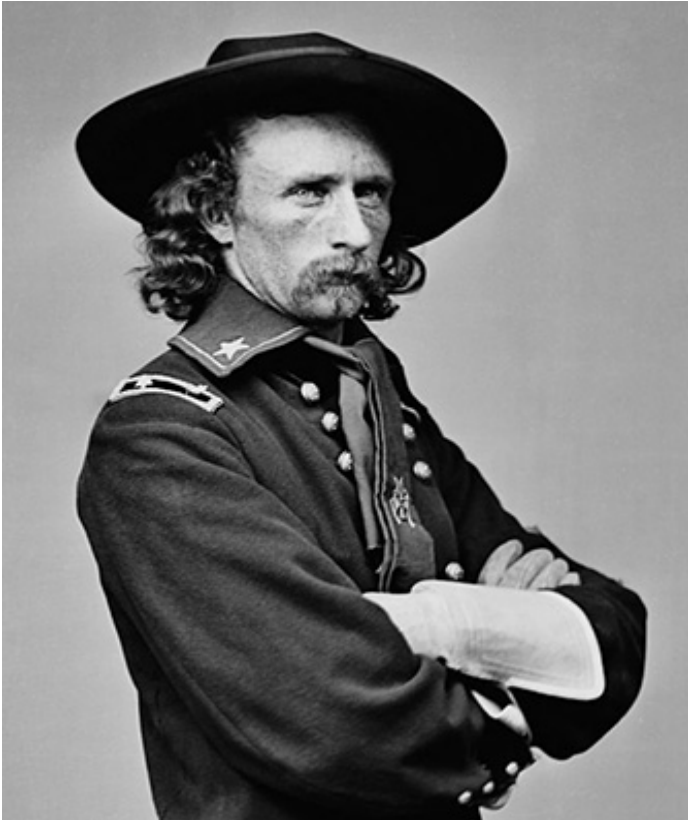
Lieutenant Colonel George Armstrong Custer

According to Custer's own writings, part of his strategy had been to hold the women and children as hostages so the male warriors would disband without violence. This was part of the U.S. doctrine, under the " Manifest Destiny " thesis, that it was meant to rule all the lands from the Atlantic to the Pacific.