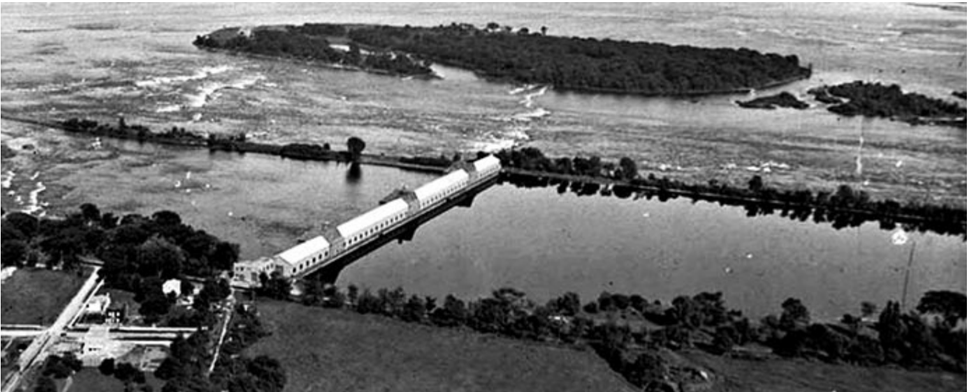
Lachine Hydroelectric Dam – Image: Ministère des Terres et Forêts, Public domain, via Wikimedia Commons