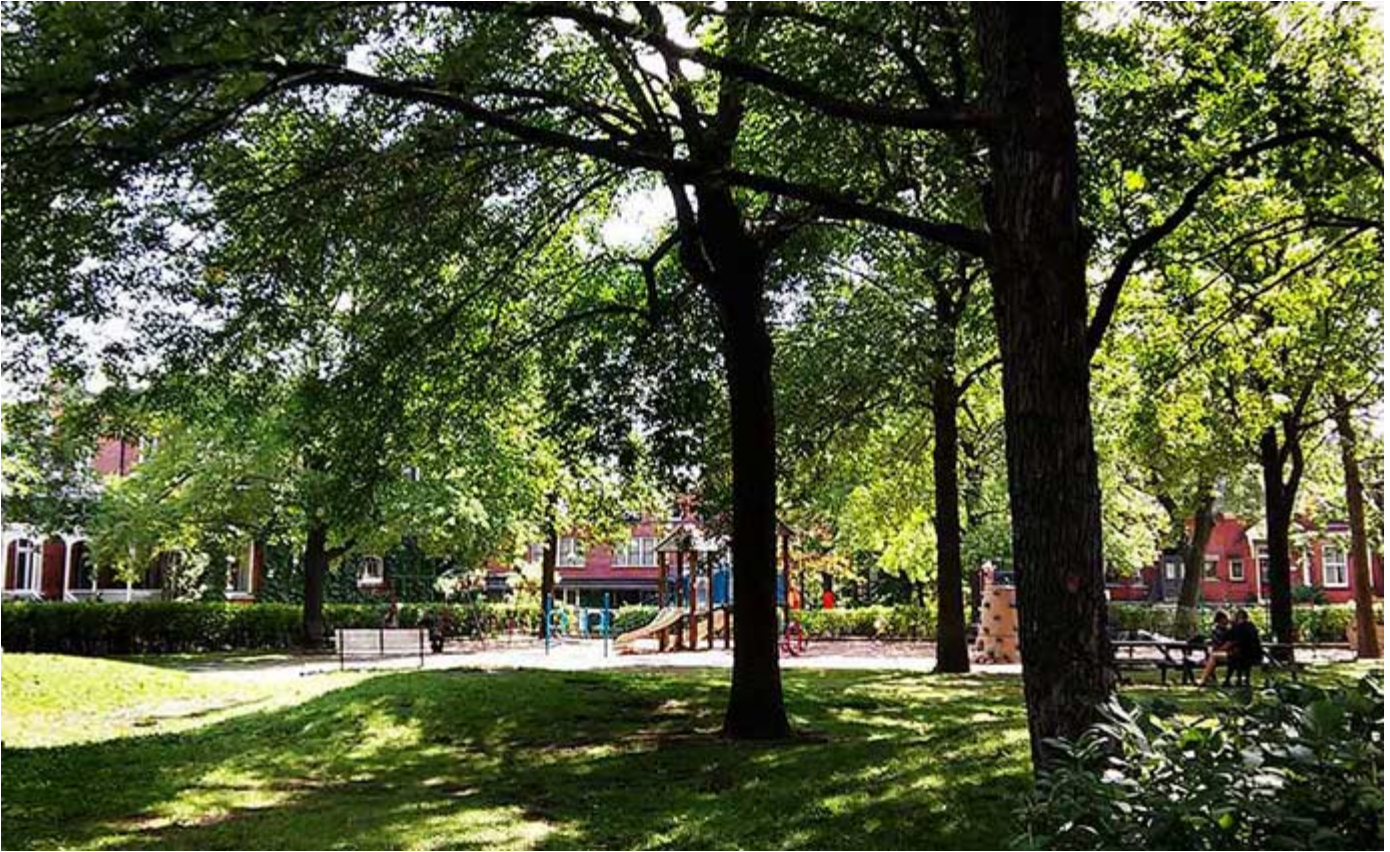
Stayner Park