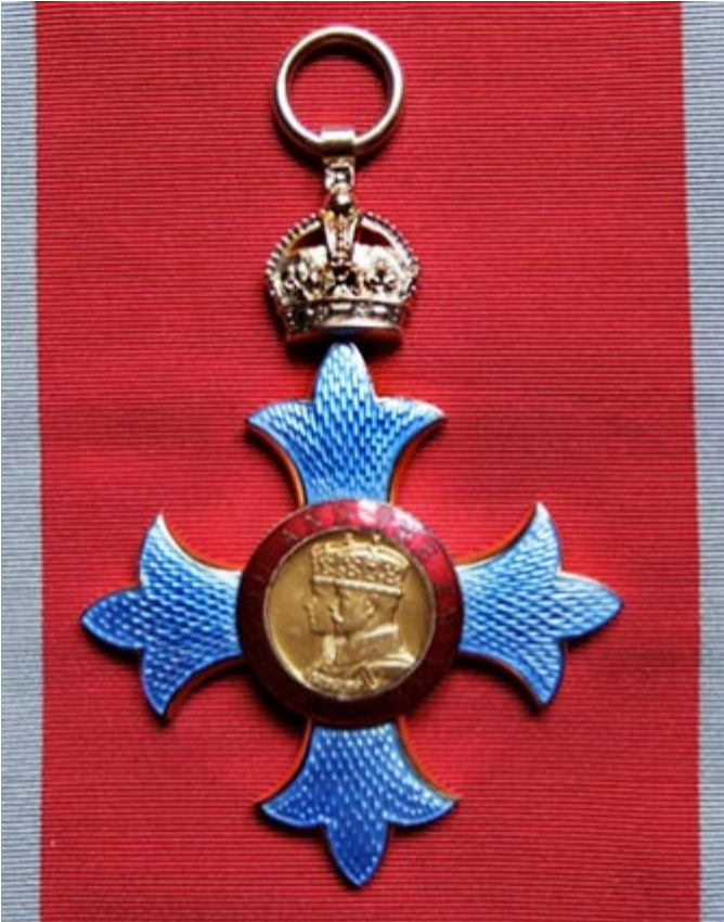
Order of the British Empire