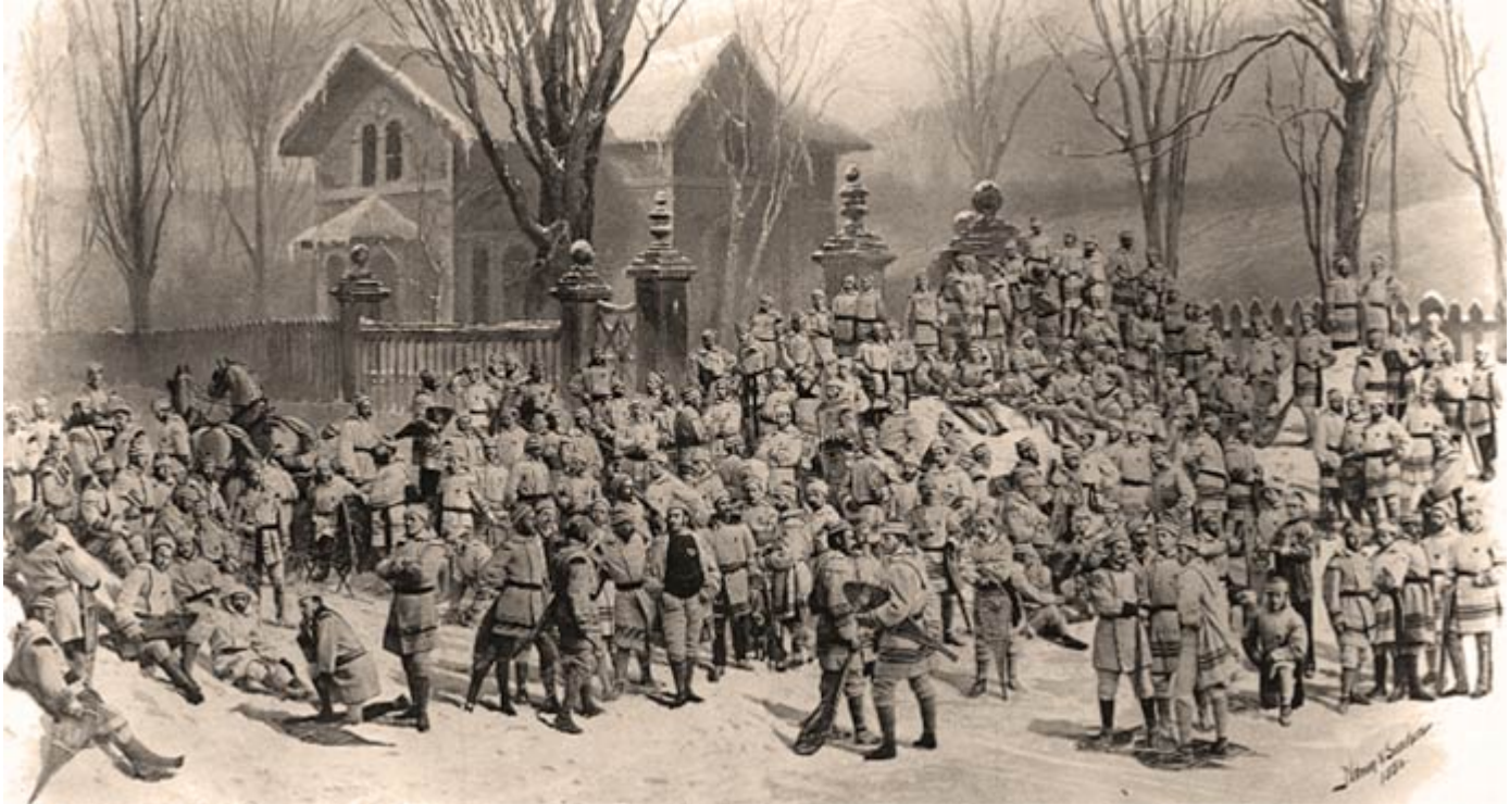
St. Georges Snowshoe Club at McGill gates, Montreal 1880