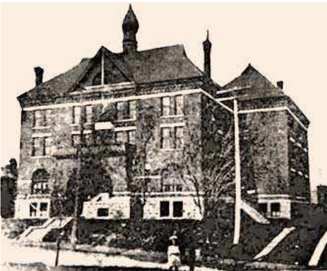
French Methodist Institute – Image: imtl.com

The street's name also has a dubious distinction: it is the City's most misspelled word. Specifically, it is referred to as Staynor or "Stayner" depending on the context. The question is – which name is correct? Looking at the street sign and the valuation roll the street is named "Stayner"; however, Council proceedings, until 2013, refer to one or