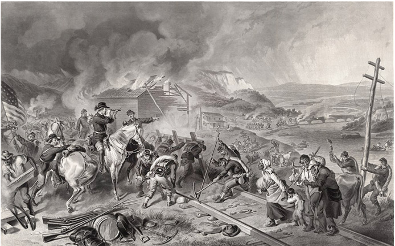
Sherman's March to the Sea

General Sherman's armies left a wake of destruction that still angers many in the American South. It was a brutal method of warfare but President Abraham Lincoln was keen to end the war as soon as possible and silence the stiff resistance Union forces were encountering outside of Richmond, Virginia, the capital of the Confederate States of America. General Robert E. Lee's Army of Northern Virginia was putting up a stout and determined resistance which in places had both opposing armies engaging in trench warfare.