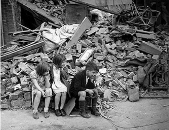
Children left homeless after London Blitz

Some people reading this article will recall the news reports televised during the War in Vietnam , which were horrible enough. The Associated Press, via its excellent reporting staff stationed in Vietnam, took some very graphic and disturbing images that captured the tragedy of the conflict that engulfed Vietnam, Cambodia, and parts of Laos.