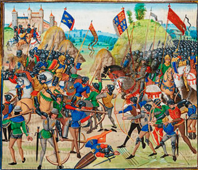
Lancaster's chevauchée of 1346, Battle of Crécy – Image: Jean Froissart , Public domain, via Wikimedia Commons

From the description in the Wikipedia page: