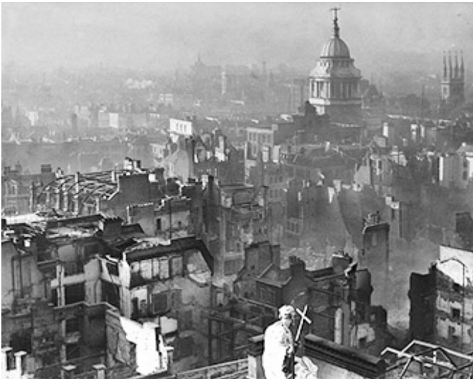
View of London from St. Paul's cathedral after the Blitz

It's a great pity that this general's advice was not heeded. Like the American Civil War, you had the phenomenon of millions of young men in Britain, Canada, Australia, New Zealand, South Africa, France, Germany, Austria-Hungary, and Russia enlisting so that they would not miss out on the experience, the "fun", with many expecting that the war would be over by Christmas.