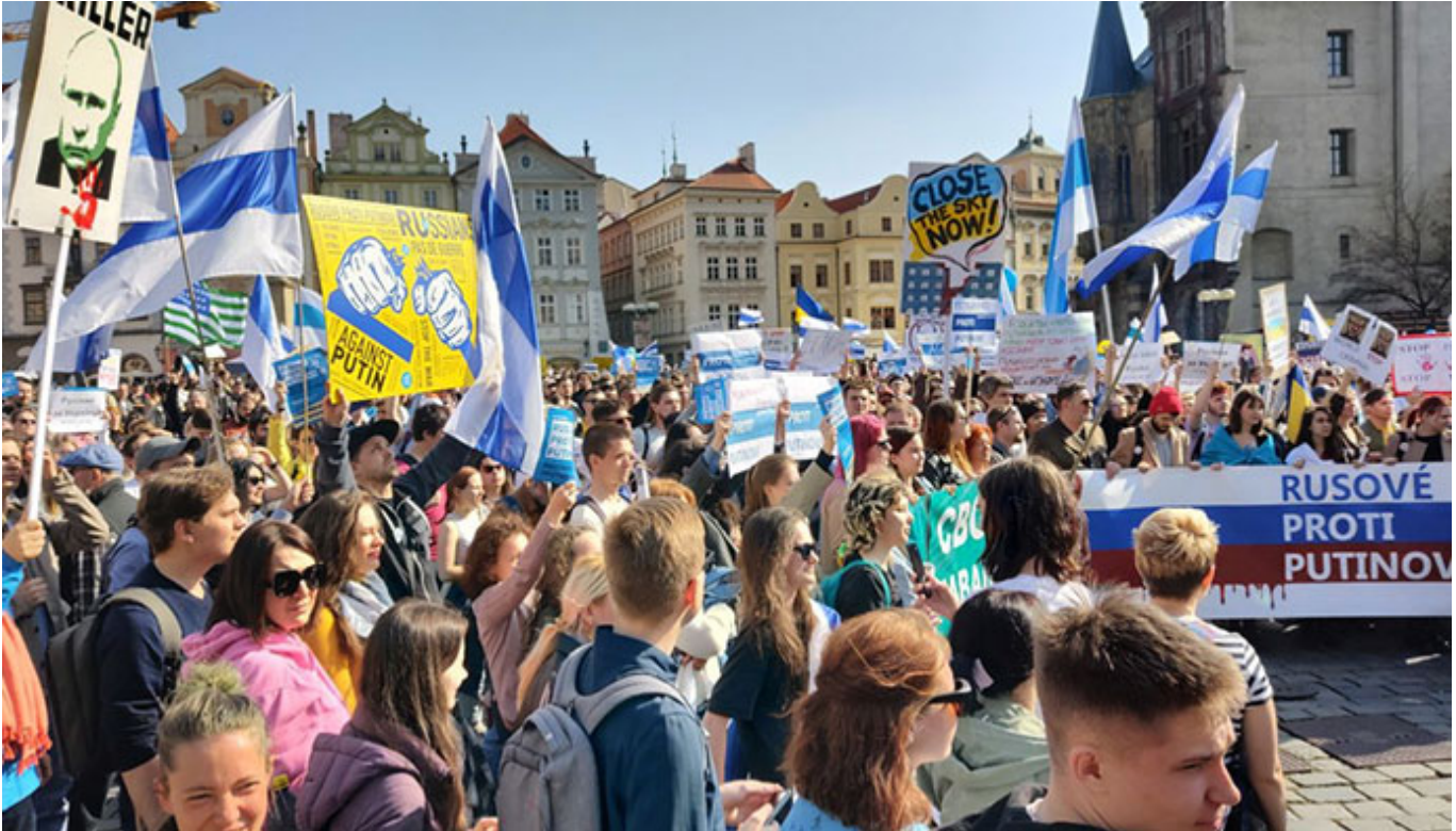
Russians protesting war on Ukraine in Czech Republic

We can advocate for regime change by encouraging individuals high up in the government and military and calling on ordinary Russians to rise up. We can urge the military units to stop fighting and for the police to no longer obey orders from the government to arrest people demonstrating their opposition to the war.