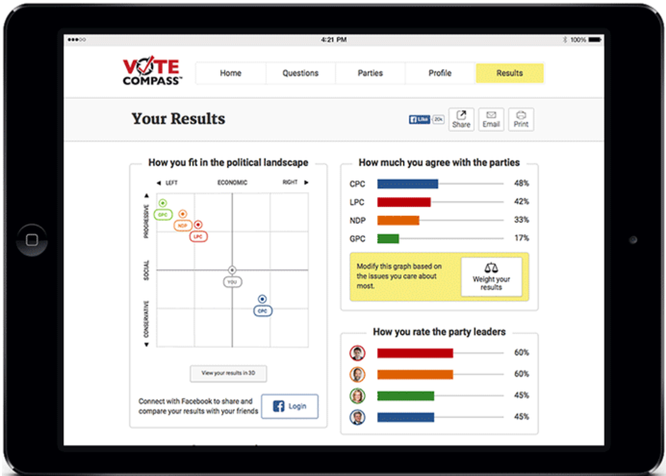
Example of a Vote Compass snapshot from the 2015 Canadian Federal Election