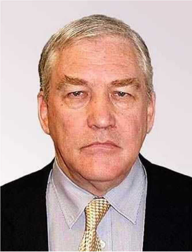
Conrad Black mug shot

It is not clear if he may seek re-institution of his Canadian citizenship either as an immigrant investor or employee or perhaps as the spouse of his wife, journalist Barbara Amiel (she of “my extravagance knows no bounds” fame).