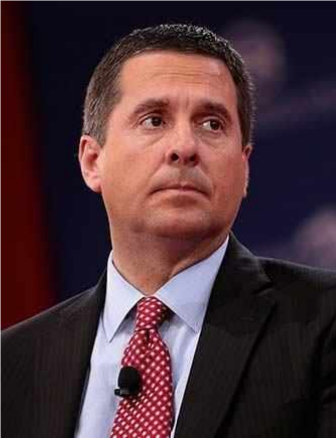
Nunes at CPAC in 2018

Trump pardoned him in 2019. Will flattery get you everywhere, some ask.