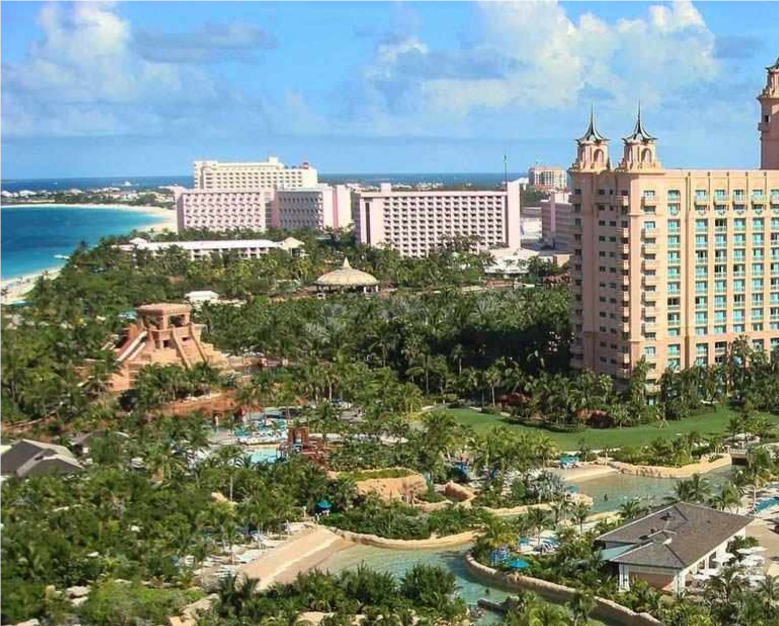
A 5-star Bahamas hotel – Image: YoTuT via StockPholio.net