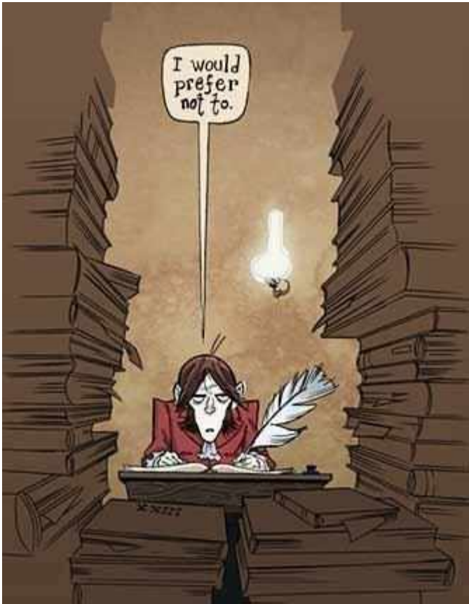
Bartleby the Scrivener – Image: illustration from softcover book