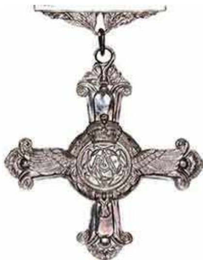
Distinguished Flying Cross