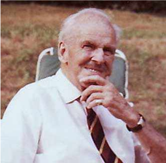
Charles Basil Price