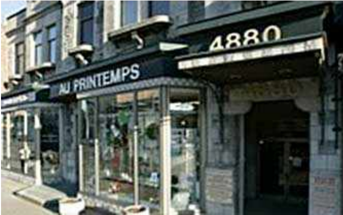
4880 Sherbrooke Street