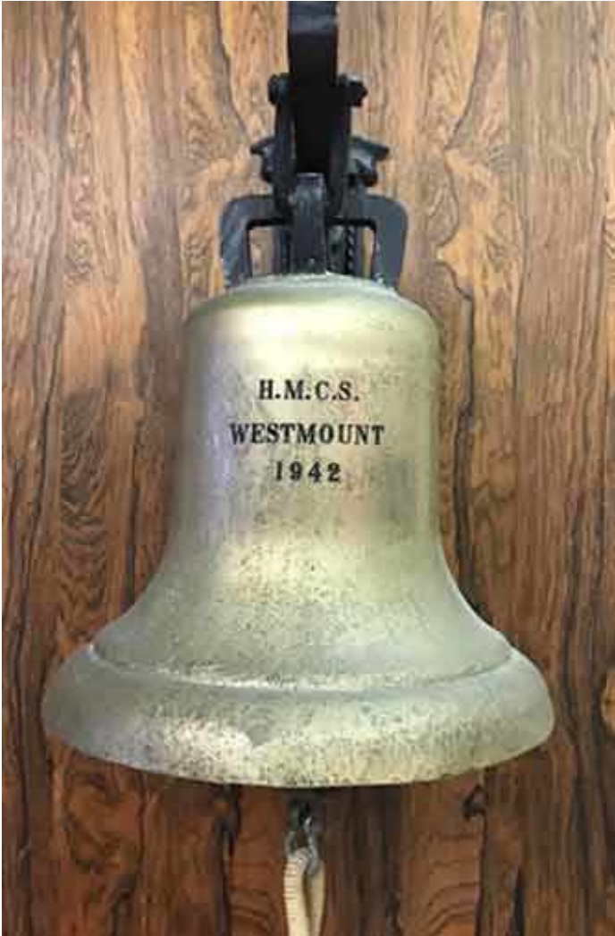
Bell, H.M.C.S. Westmount