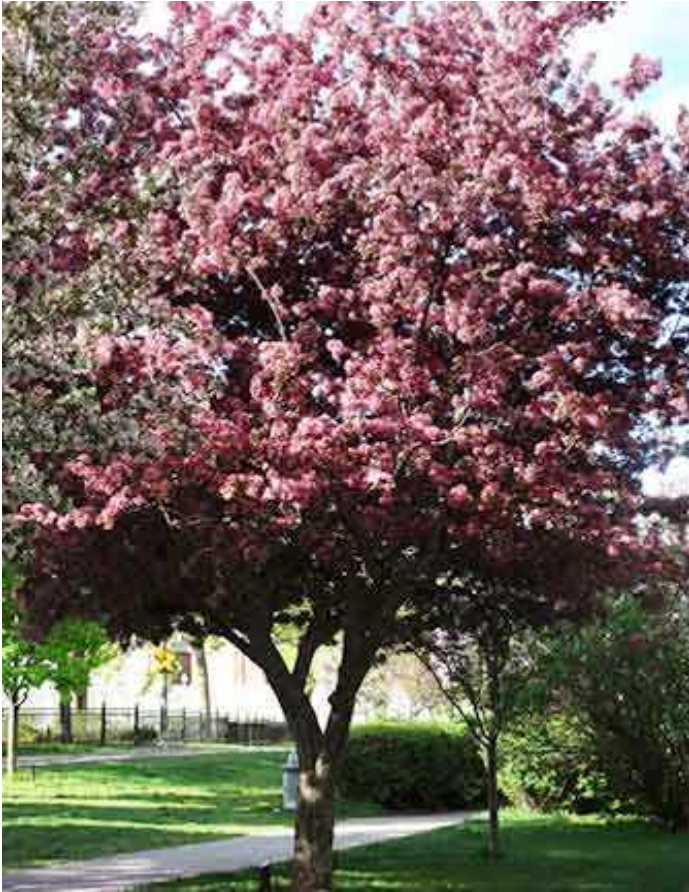
Crab-apple trees in Westmount Park

One gets the sense of a war-weary group of citizens. Not a surprising observation give that the interwar period lasted a mere 21 years.