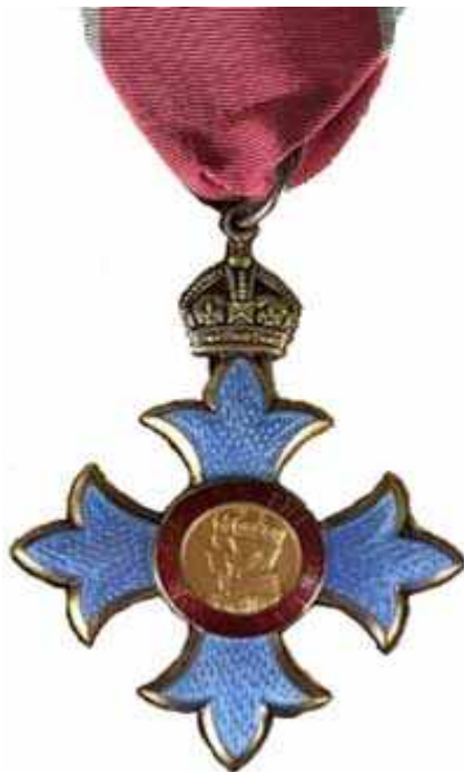
Order of the British Empire