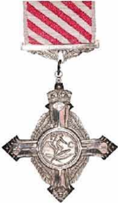
Air Force Cross