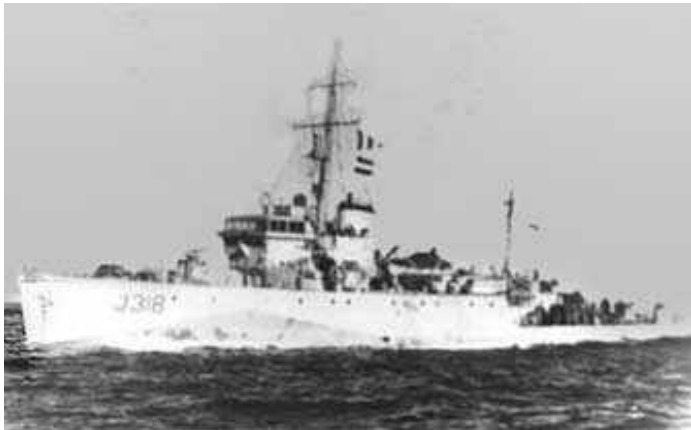
H.M.C.S. Westmount