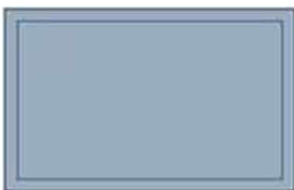
Third Canadian Division Formation Patch

Your Committee recommends that Council authorize the granting of a permit to l'Institut de Notre Dame du Bon Conseil, to occupy their property at 4287 Western Avenue as a social and educational centre.