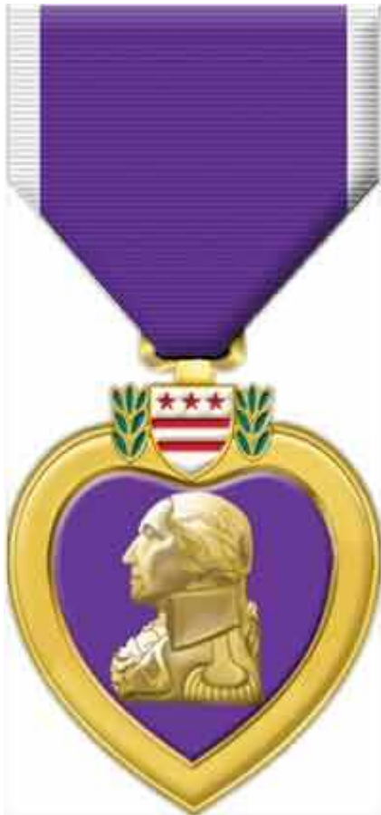
Purple Heart medal