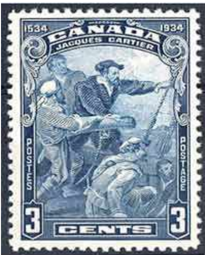
Canada Postage 1934 – Image: (Public Domain)