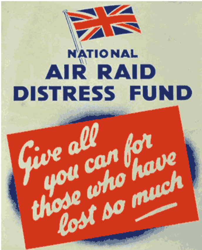
National Air Raid Defence Fund poster