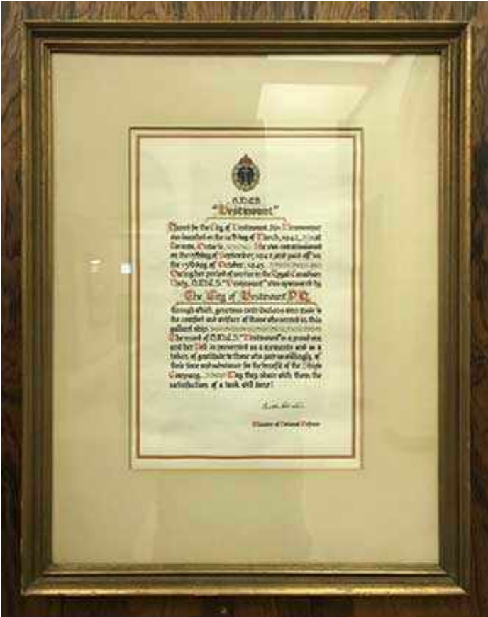
H.M.C.S. Westmount letter Image: Anthony Caisson, City of Westmount