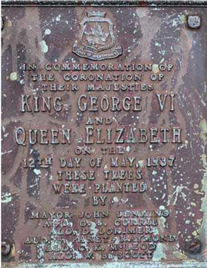
Plaque King George Park