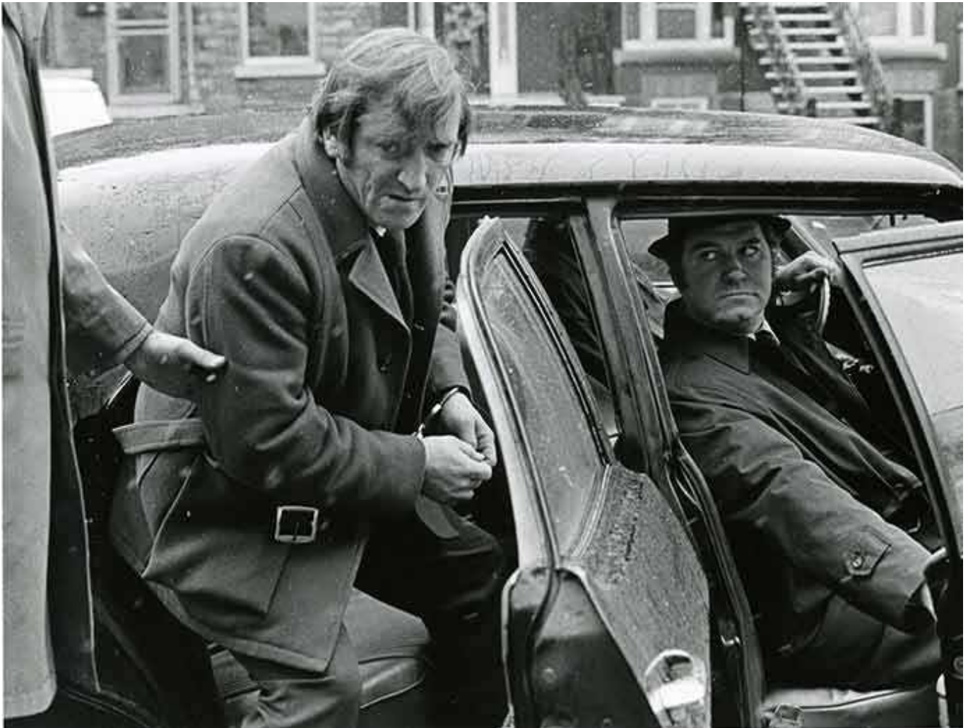
Les ordres – Michel Brault

Another highly anticipated title is SAINT-NARCISSE , directed by Bruce LaBruce, which was presented at the Venice Film Festival earlier this year. The enfant terrible of Canadian queer cinema promises to surprise moviegoers once again.