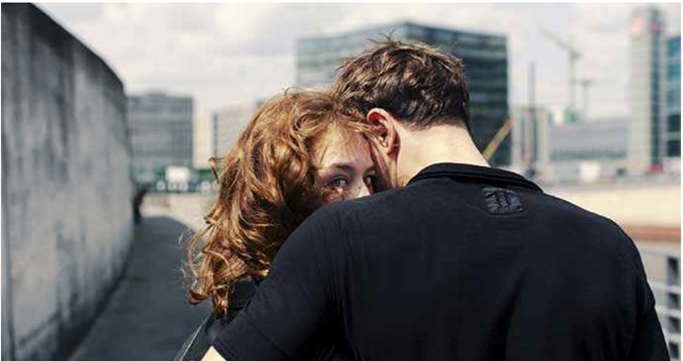
Undine – Christian Petzold