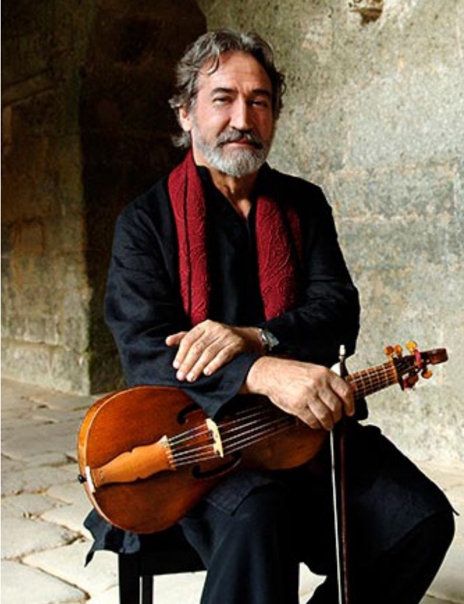
Jordi Savall

So do not sulk your pleasure as a music lover. Subscribing to such an exploration is therefore appropriate for all lovers of Euterpe. A Maestro of this calibre rarely comes to Montreal; it is best to rush to the concert on Monday, November 7 in the sublime Maison Symphonique. Your ears and your heart, musical organs par excellence, will thank you infinitely.