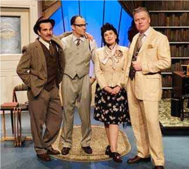
Moonlight And Magnolias cast