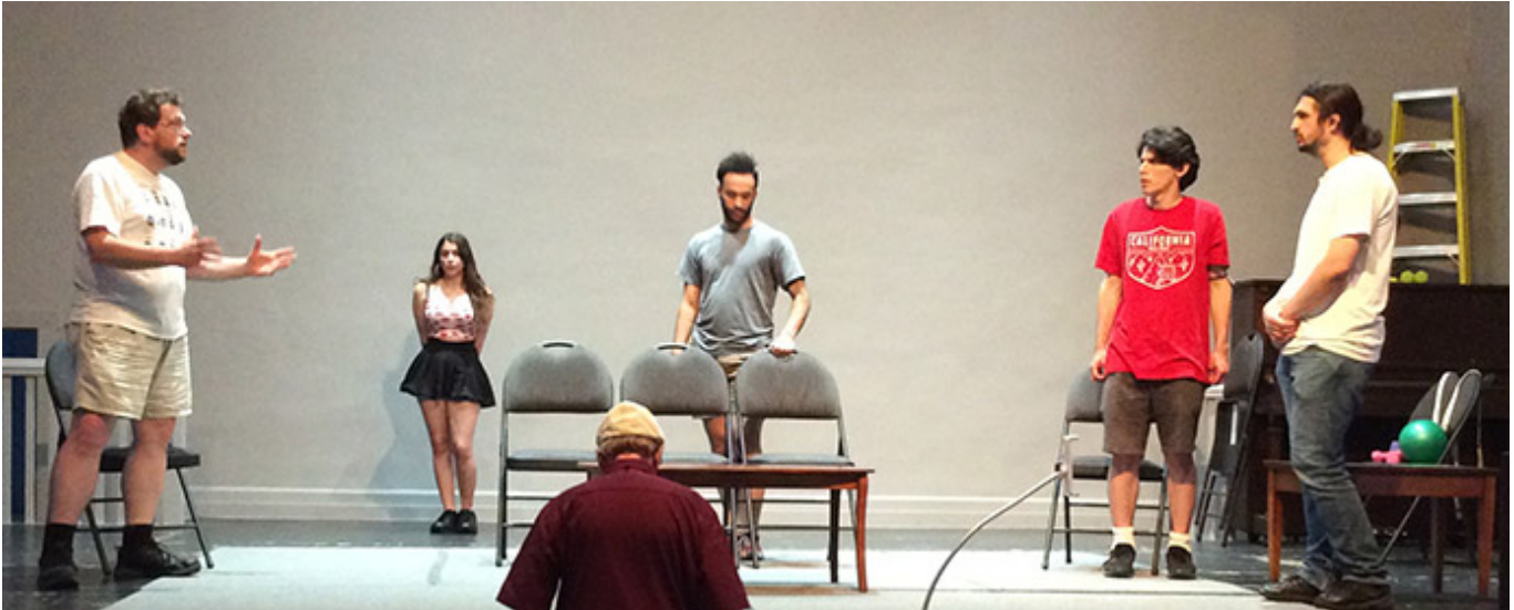
The Youngers rehearsing And Then There Were None