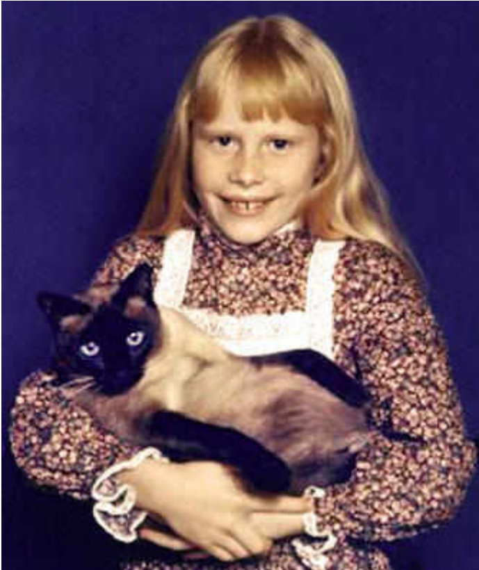
Amy Carter with Misty