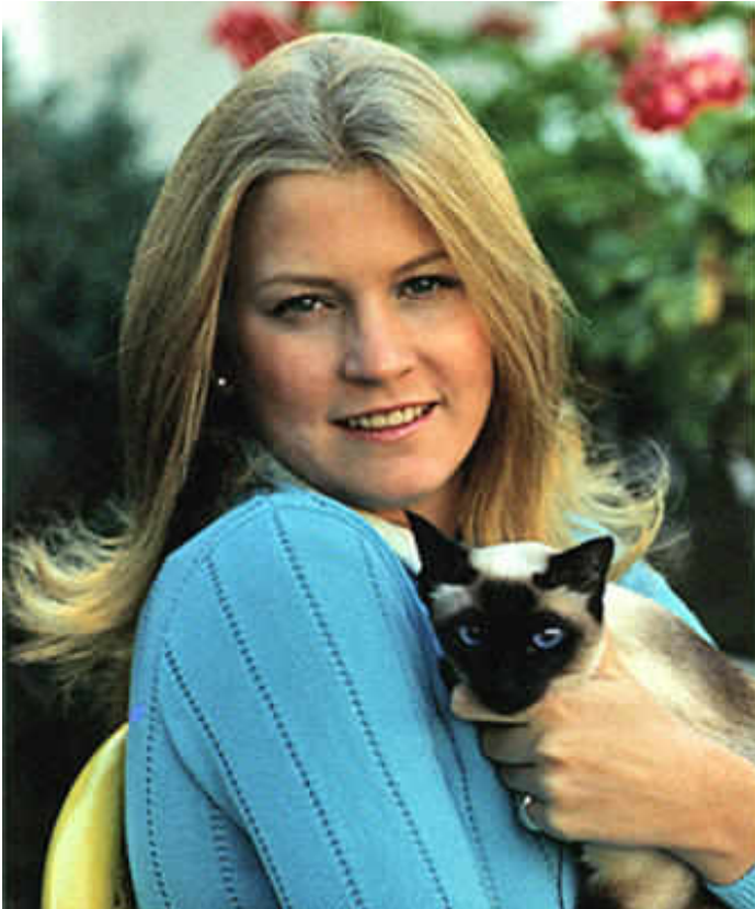
Susan Ford with Shan

John F. Kennedy #35's famous cat Tom Kitten was actually a gift to his daughter Caroline. It apparently got along with his nine dogs.