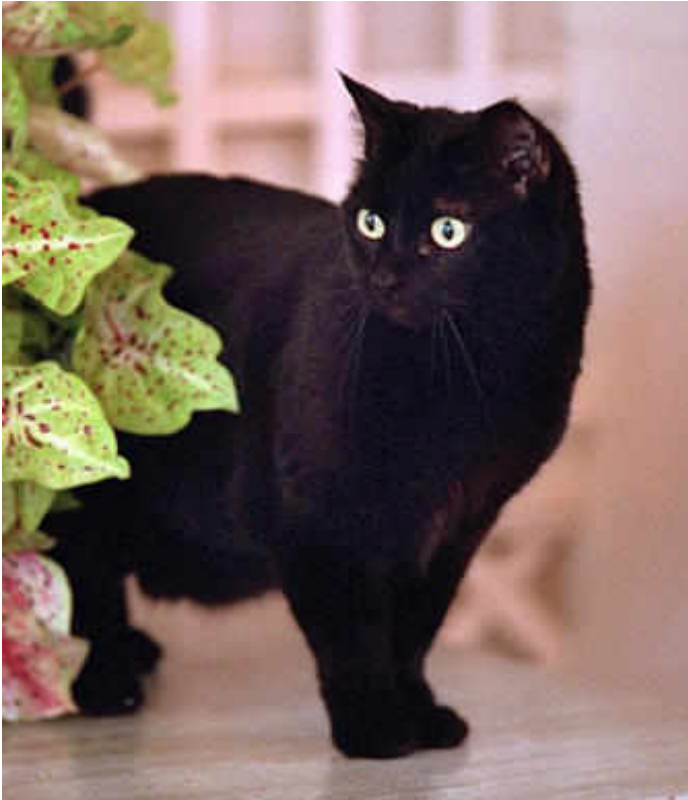
Bush family cat India

I have not considered livestock as pets, although a few horses, cows, goats and sheep may have been treated specially. Likewise, I have not considered wild animals as pets. Calvin Coolidge 's wife's pet raccoon came close, but not the other exotics they maintained in what amounted to a private zoo: a black bear, an antelope, an alligator, etc.