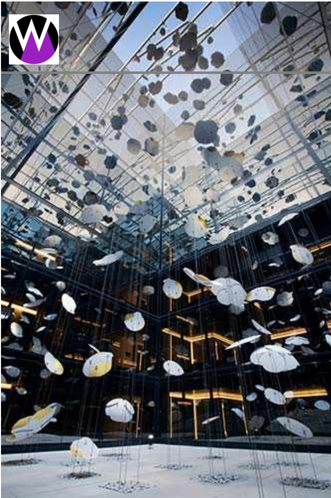
The all-white installation with gilded accents of 24-karat gold

is made up of over ninety floral suspensions ranging from thirty centimetres to one meter in diameter, made of lightweight aluminum. These garlands cascade through the atrium from the seventeenth to the eighth floor, evoking the cycles of nature—the blossoms of spring flowers, the movement of petals adrift on a summer breeze, the spill of autumnal leaves and the lightness of falling snow.