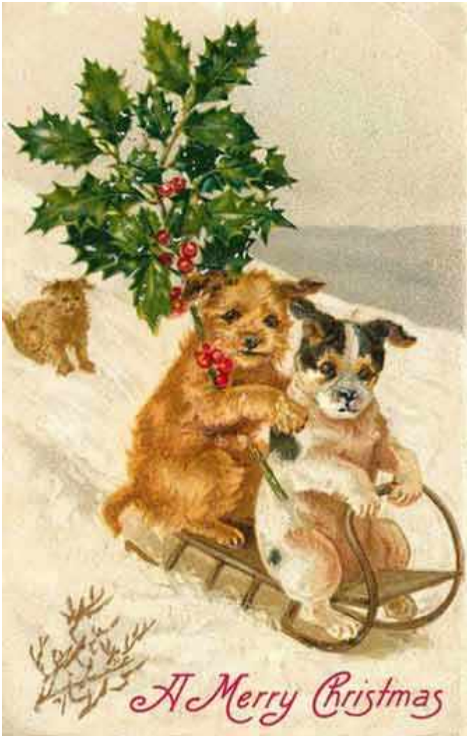
Vintage Christmas card

The village instituted a tax of $1.00 per male and $2.00 per female dog in an effort to control the number of stray animals. That is quite a hefty sum, in 1809, considering the village constable's salary was $7.00 per month.