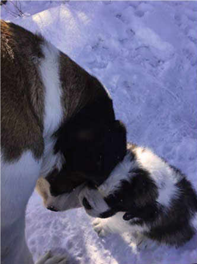
Giada (Westmount's Saint Bernard) with her mother Tootie

“That the Police, Fire and Health Committee be instructed to consider the best method of effecting a reduction in the number of dogs in the Town.”