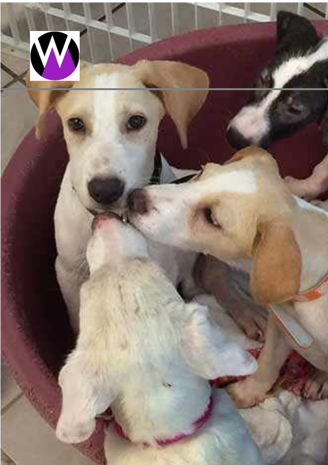
Staffed entirely by volunteers and funded donations, Potcake

Place offers a second chance to puppies that would otherwise live out their lives scrounging for food and living in the island's dense underbrush.