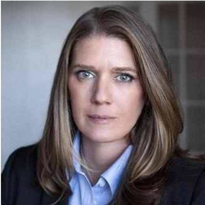
Mary Trump

U.S. government for back taxes due. Insurance companies on fraudulent valuations. Russian oligarchs on personal guarantees.. Deutsche Bank bringing mortgage foreclosures. Mary Trump , on having been cheated of her inheritance.