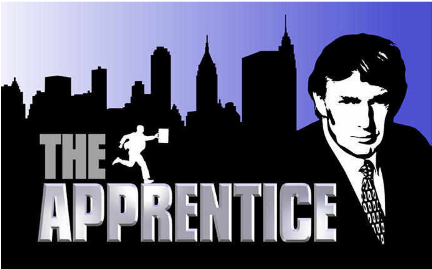
The Apprentice promo banner

He has lost inherited money on real estate, casinos, airplanes and a school. The only money he has earned for “work” was playing himself in the TV show The Apprentice and his Presidential salary. Any life savings may be dissipated in defending all the above matters.