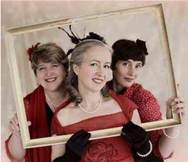
The Honeysuckle Sisters

At the Brome County Historical Society, 130 Lakeside 11 am – Theatre – United We Stand 12:30 pm – Honeysuckle Sisters Concert