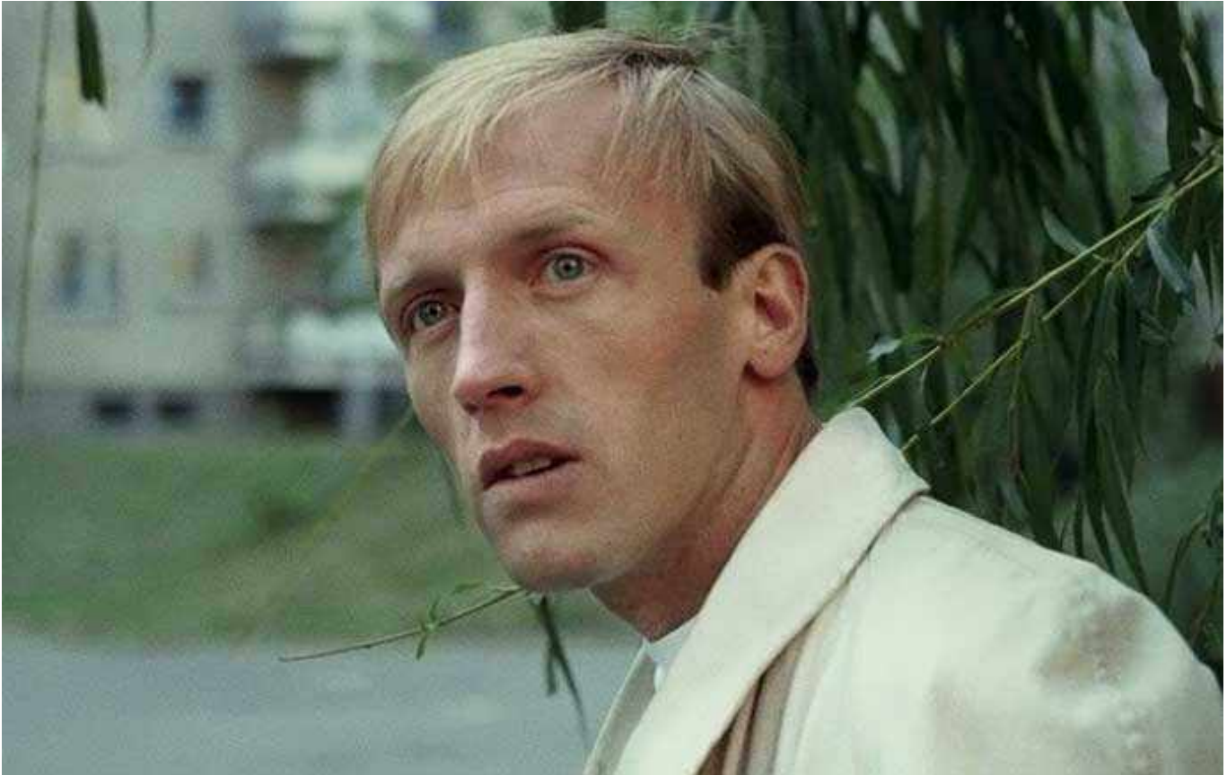
Images: stills from the Dekalog series