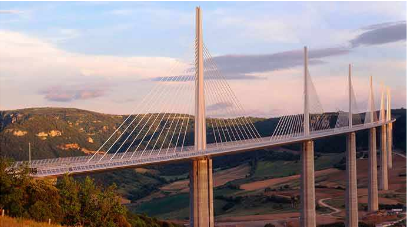
Viaduc de Millaut

We can credit Foster + Partners with several impressive achievements around the world, including the Millau Viaduct in France, a bridge with the tallest pylons in the world, and the highest road bridge in Europe that is taller than the Eiffel Tower, which for many years was the tallest structure in France; and Terminal 3 of the Beijing Capital International Airport in China, which is the second-largest terminal building in the world while being exemplary in terms of user experience, environmental responsibility and operational efficiency.