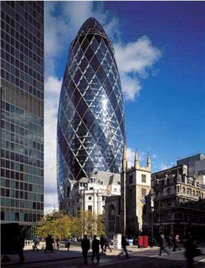
Swiss Re HQ, 30 St Mary Axe

Founded in 1967 by Lord Norman Foster, who heads the firm, Foster + Partners works on every aspect of design, from concept to realization and from architecture to industrial and urban design. For the past 50 years, Foster + Partners has consistently demonstrated a commitment to making the human element central to its projects.