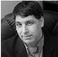
Irwin Rapoport is a freelance journalist.

Read also: other articles by Irwin Rapoport