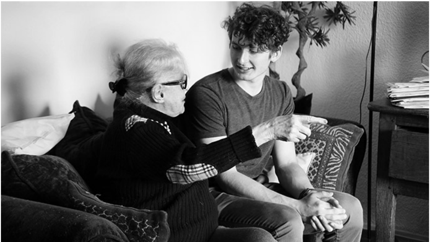
A volunteer visits with a senior