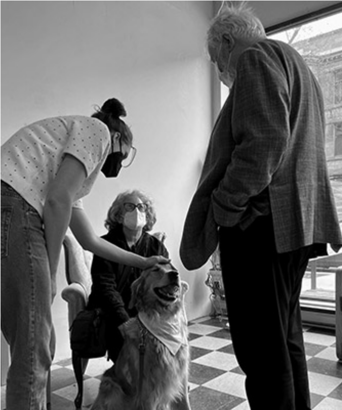
A volunteer provides pet therapy to seniors at home

As a matter of fact, The Yellow Door is a registered charity that operates intergenerational programs and activities that bring young adults and seniors together in the promotion of mental and physical health and the prevention of social isolation among all ages.