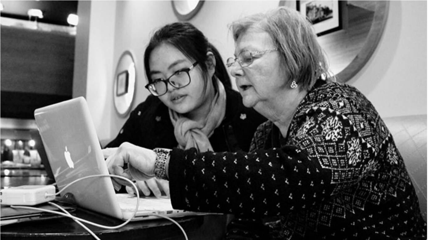
A volunteer gives tech support to a senior

WM: Is there a greater need for The Yellow Door services?