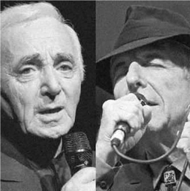
Hommage à Charles Aznavour et Leonard Cohen