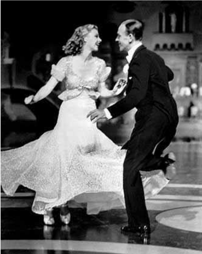
Ginger Rogers and Fred Astaire

As she was taller than him, he was fitted with a top hat, which became a trademark of his, even into old age. They did attain great fame as a child dancing couple but that ended as they grew older and she married into the British aristocracy.