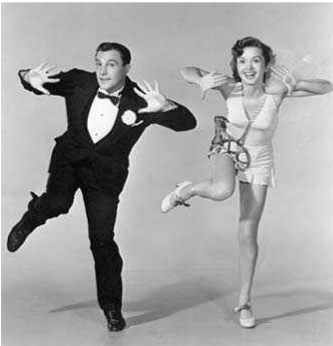
Gene Kelly and Debbie Reynolds

This triggered calls from Hollywood and the MGM musical For Me And My Gal (1942) opposite Judy Garland.