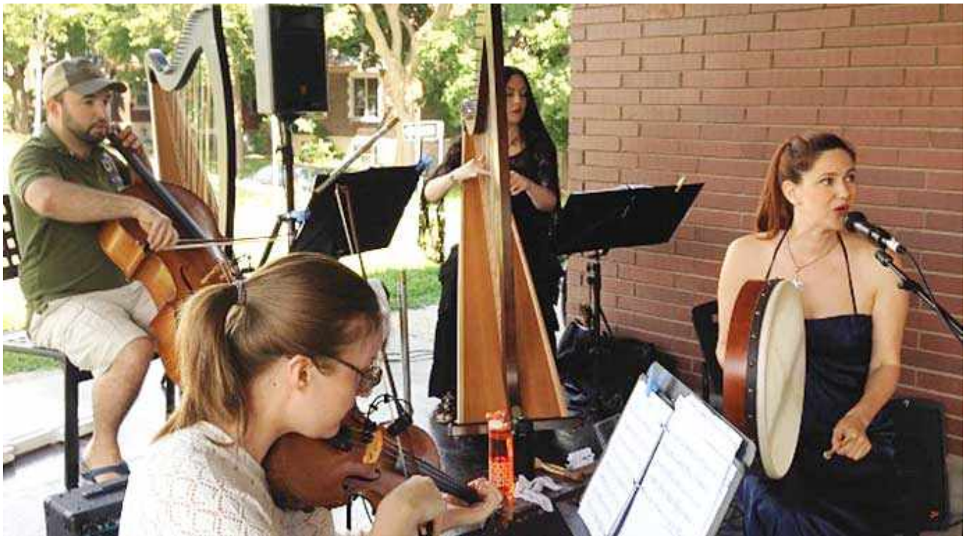
The Celtic Four at Westmount Park