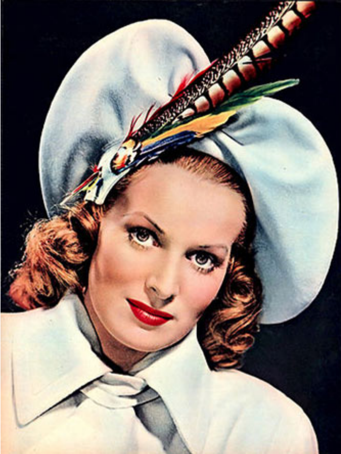
Photo of Maureen O'Hara from Modern Screen magazine – Image: Public Domain

Founded in 1992, it is approaching its 30th anniversary. Unlike other film festivals, which range from 3 to 10 consecutive days, it is spread out weekly over several months, from February to April, with an opening wine and cheese and a closing gala buffet. The nine or so films included are not limited to those made in Ireland but also those featuring Irish actors or directors. In addition, subscribers are usually invited to one or two interim events, usually at Hurley's Irish pub, featuring novelty short films or music.