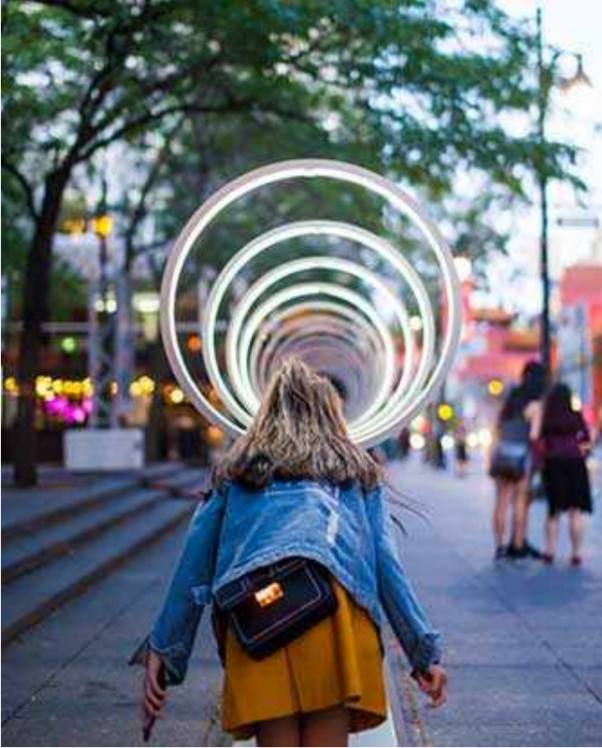
Spectrum, HUB Studio

Spectrum is a new installation co-produced by the Quartier des Spectacles Partnership in collaboration with a major international partner, Quays Culture , an organization presenting temporary public art and cultural events in Manchester, England. In 2018, the two organizations joined forces to issue a call for proposals, open to artists from Quebec and the United Kingdom, for an outdoor digital interactive work. The proposal from Montreal-based interactive studio HUB Studio was chosen from among more than 20 submissions. Spectrum sheds light on the phenomenon of communication, by displaying the path taken by the waves generated by voices and other sounds. Here, the fundamental means of interpersonal communication, speech, is disconnected from language. Instead, it becomes a cascade of waves and luminous pulses, illustrating the fascinating trajectories of sound. Spectrum is also an intimate listening experience inviting people to engage in a sound-and-light dialogue with other participants and to take the time to listen, in order to see.