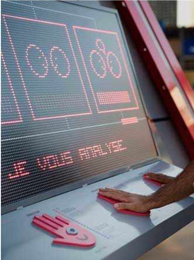
The Compassion Machine, Ensemble Ensemble

The team at Ensemble Ensemble returns to the Quartier des Spectacles with The Compassion Machine , opening August 30. This time, the installation is fitted with two cameras. Using subverted algorithms from surveillance systems, the machine analyses our capacity for kindness and our predisposition to do good. The Compassion Machine even challenges its users. An invitation to reject everyday suspicion.