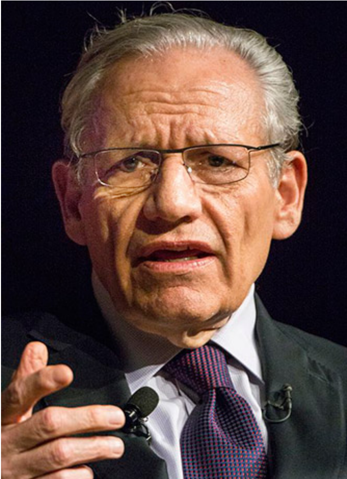
Bob Woodward

On the eve of a threatened demonstration at the U.S. capital on September 18 to protest the “political prisoners” held for trial as a result of their violent actions on January 6, and the oft postponed date of September 20 as the date when Donald Trump will be re-instated as U.S. president, it is timely that a new book, Peril , by Bob Woodward and Robert Costa , has been published.