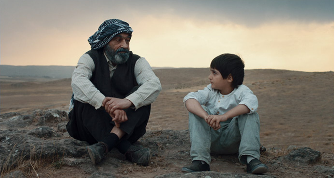
Frame from the film Neighbors

Despite these and other serious complaints, there is also some whimsical humour in some episodes. At last, the remaining family is able to secure a television set but, alas, the programs are dominated by broadcasts of soldiers marching and fighting.