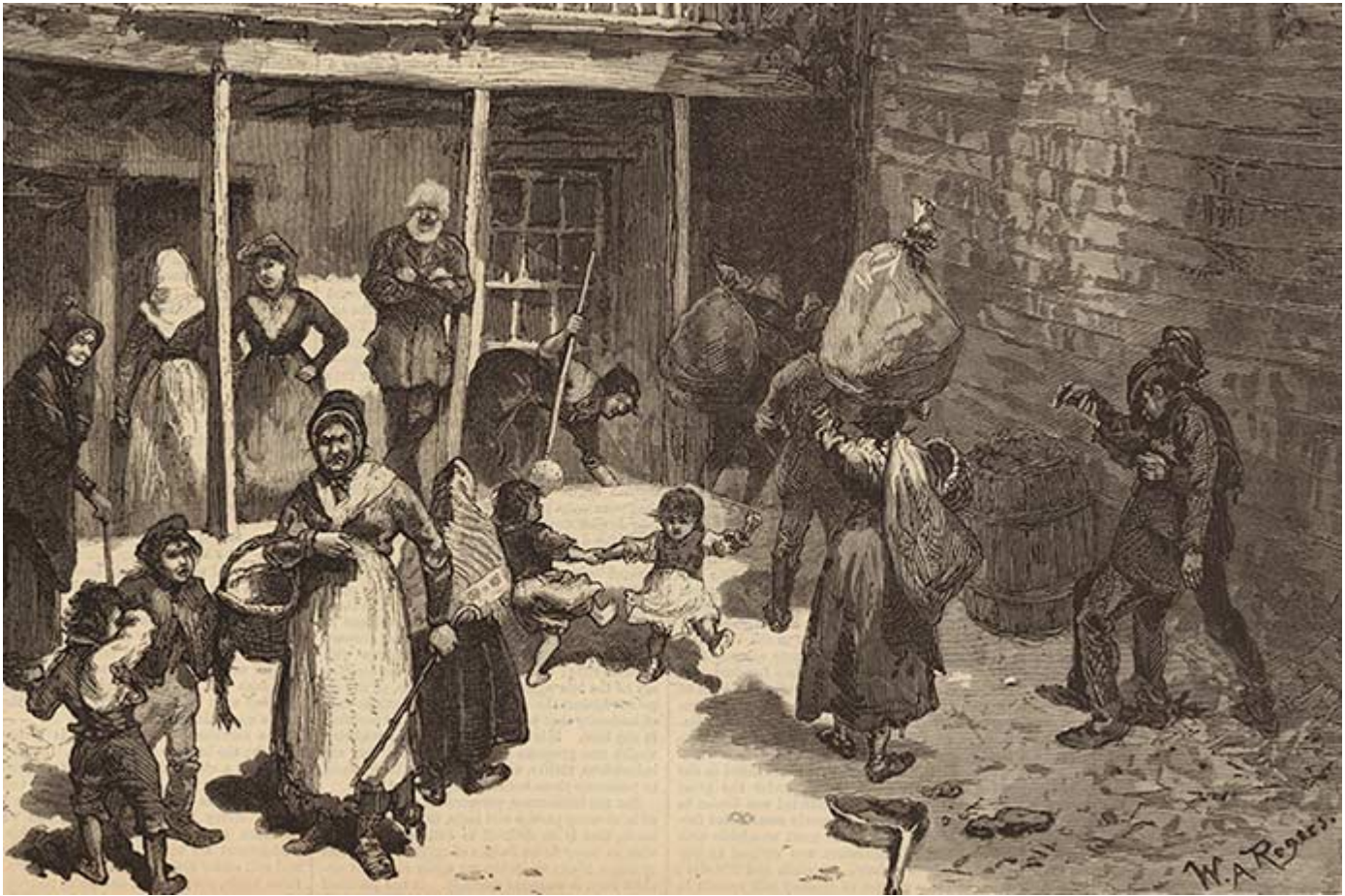
Frame from Bad Brigid: Histories and Stories of Criminal and Deviant Irish Women in North America (1838-1918)

festival was inaugurated live at Simon Fraser University in 2020. It switched to streaming due to the pandemic in 2021 and continues streaming in its now third year. (February 1 is the traditional Saint Brigid's feast day.)