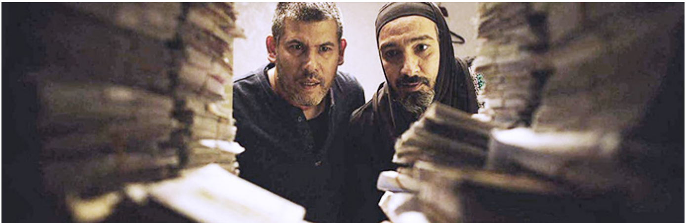
Frame from the movie Forgiveness

All in all, as if in a good-humoured party with friends – and that’s a good thing.