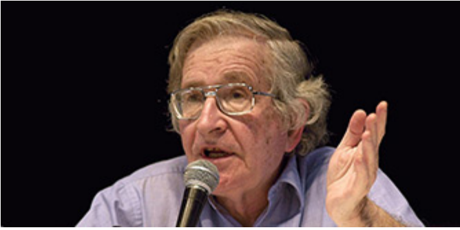
Noam Chomsky at World Social Forum 2003