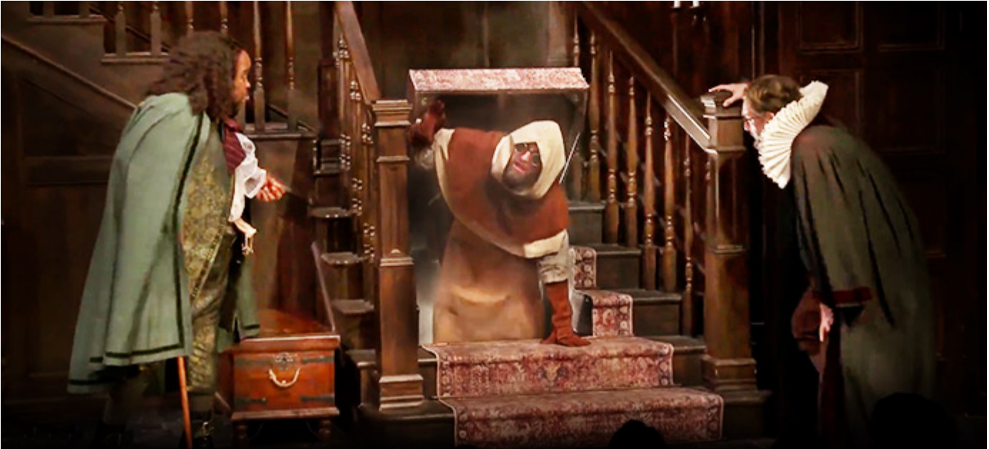
The Alchemist