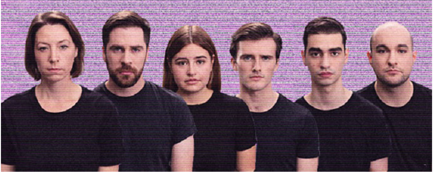
Next to Normal