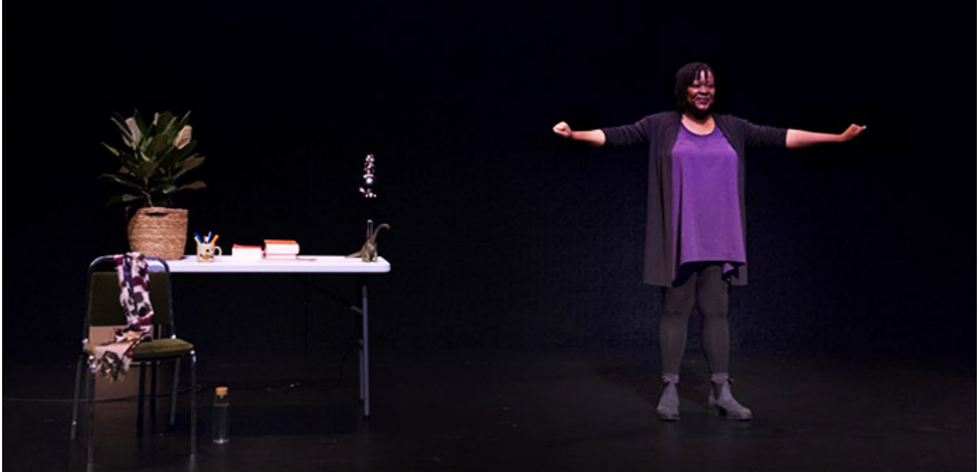
A Play for the Living in a Time of Extinction – Image: Andrée Lanthier